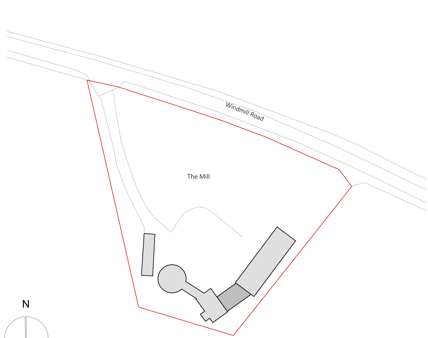
SITE PLAN Scale 1/500 Mapping contents © Crown copyright and database rights 2022 Ordnance Survey 100035207