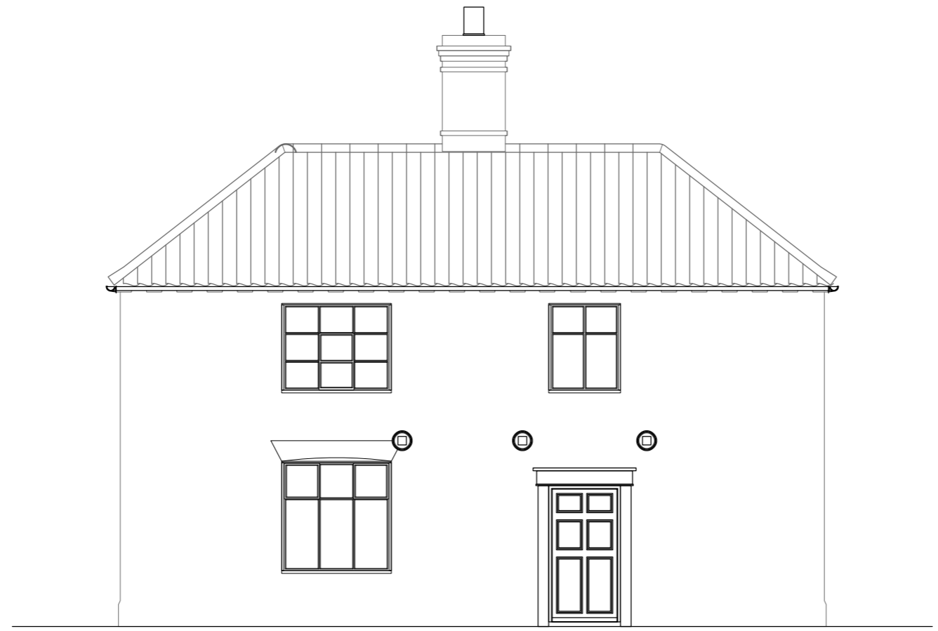
SOUTH ELEVATION 1:75