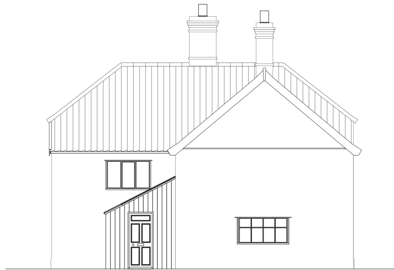
NORTH ELEVATION 1:75

NOTES DO NOT SCALE FROM DRAWINGS ALL DIMENSIONS MUST BE CHECKED ON SITE BY THE CONTRACTOR WITH ANY DISCREPANCIES REPORTED TO THE ARCHITECT