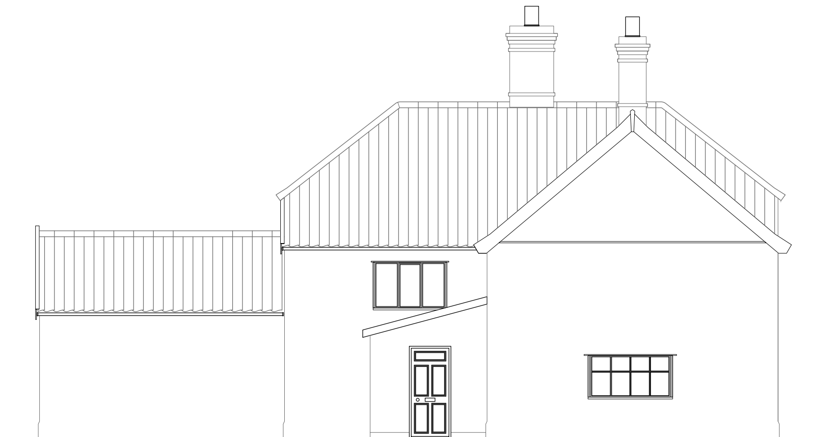
NORTH ELEVATION 1:75

NOTES DO NOT SCALE FROM DRAWINGS ALL DIMENSIONS MUST BE CHECKED ON SITE BY THE CONTRACTOR WITH ANY DISCREPANCIES REPORTED TO THE ARCHITECT