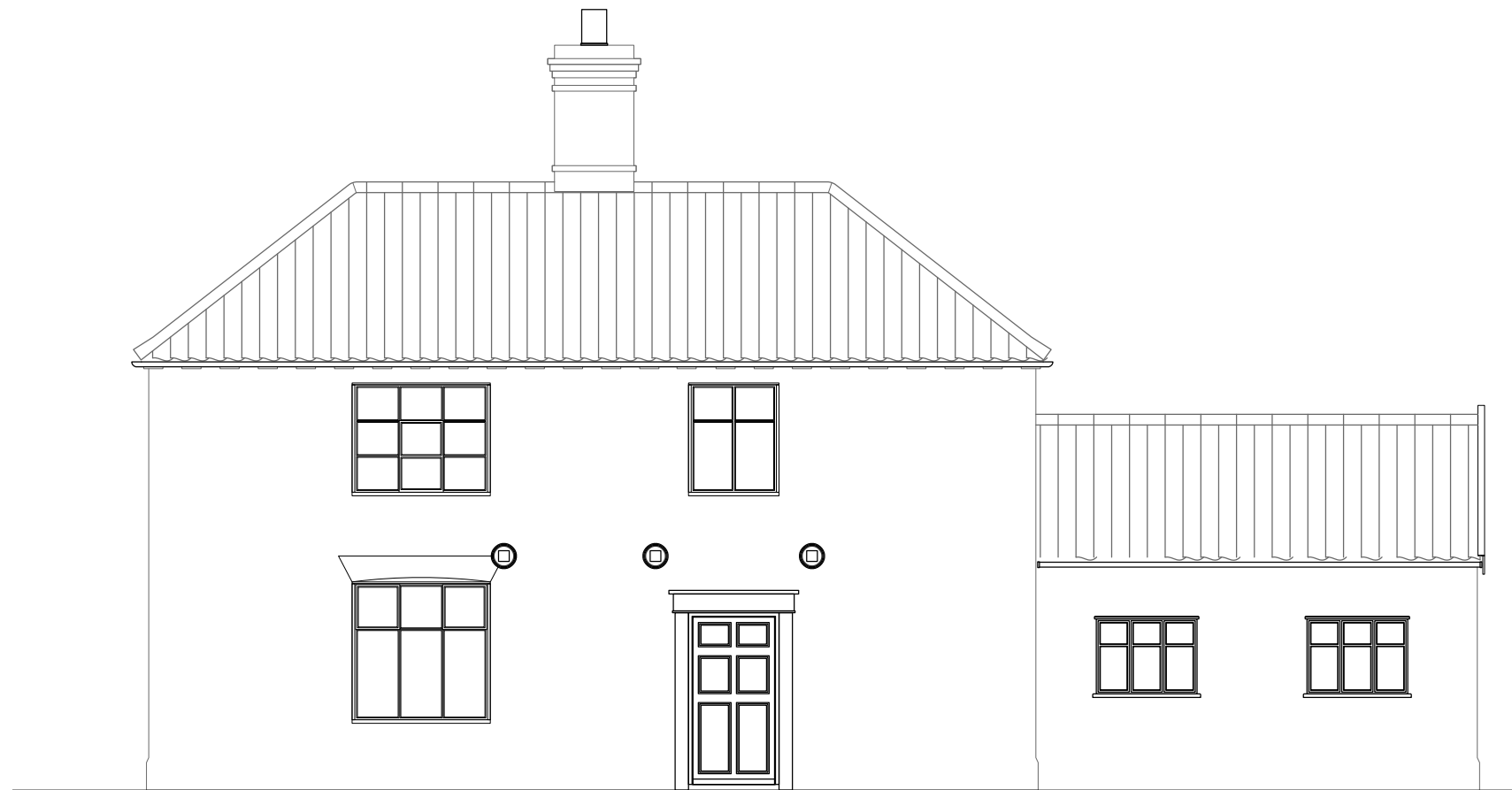
SOUTH ELEVATION 1:75