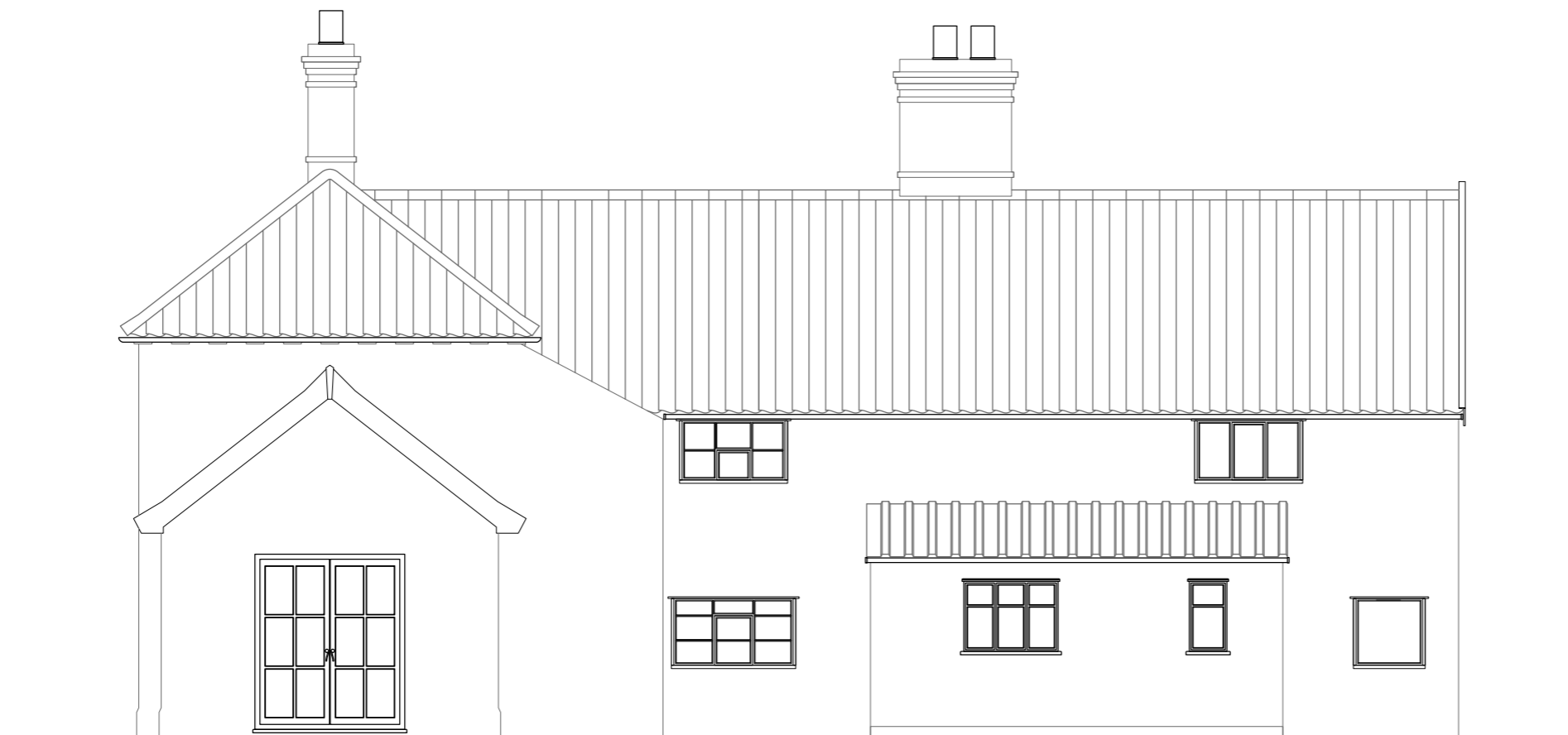
EAST ELEVATION 1:75

NOTES DO NOT SCALE FROM DRAWINGS ALL DIMENSIONS MUST BE CHECKED ON SITE BY THE CONTRACTOR WITH ANY DISCREPANCIES REPORTED TO THE ARCHITECT