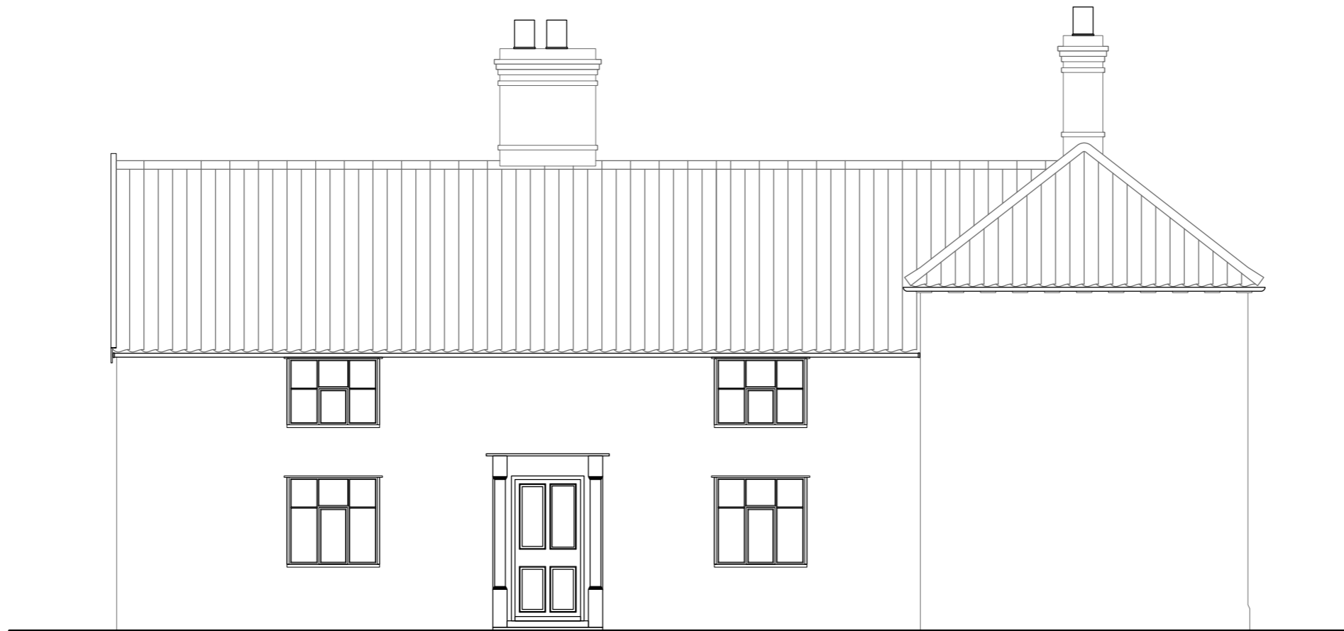
WEST ELEVATION 1:75