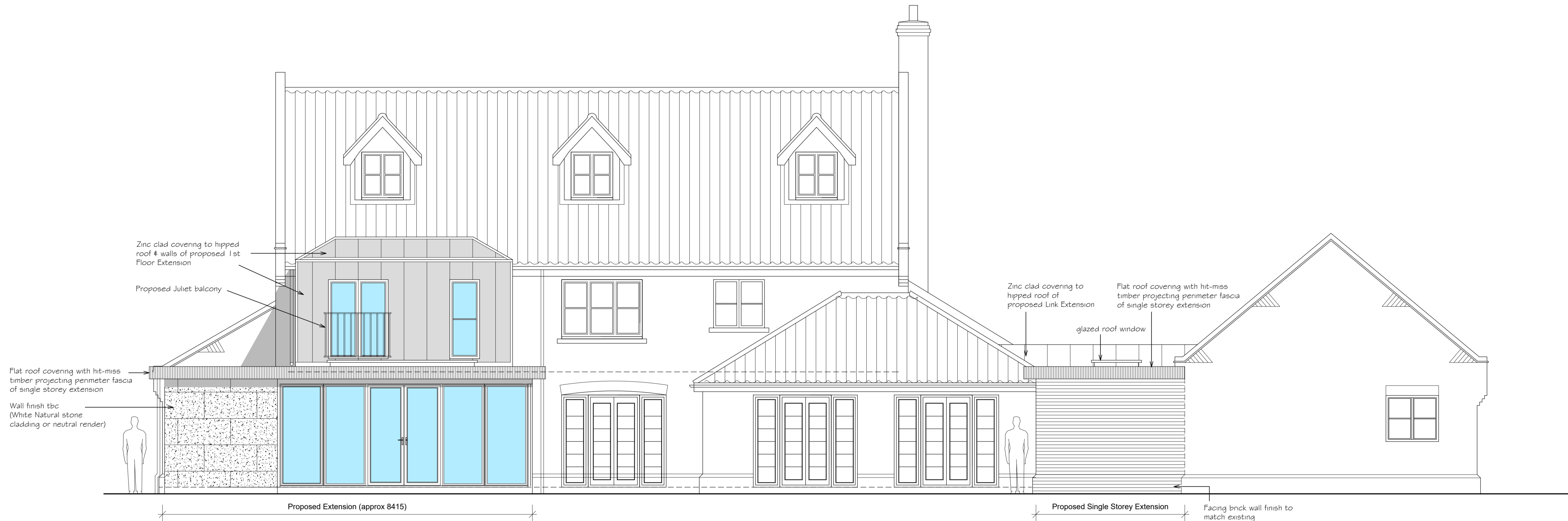
REAR (NORTH-EAST) ELEVATION AS PROPOSED