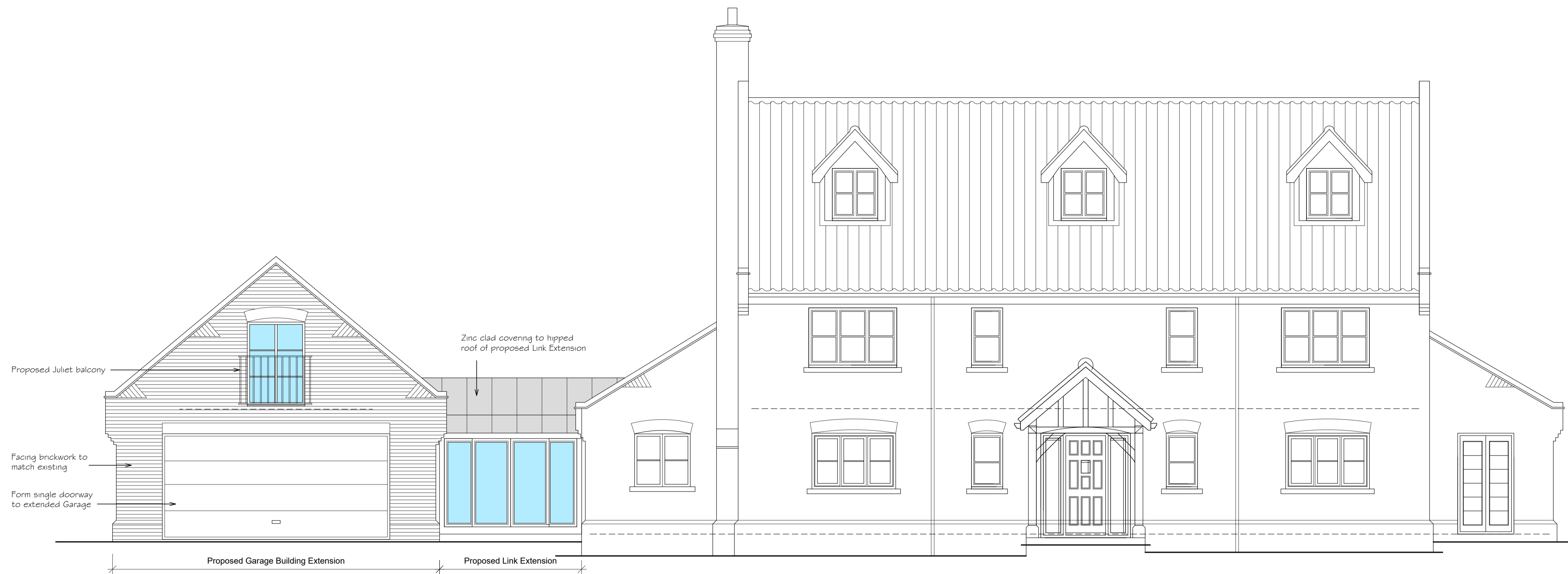
FRONT (SOUTH-WEST) ELEVATION AS PROPOSED