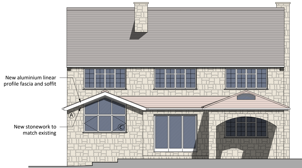
1 | REAR ELEVATION SCALE 1:100