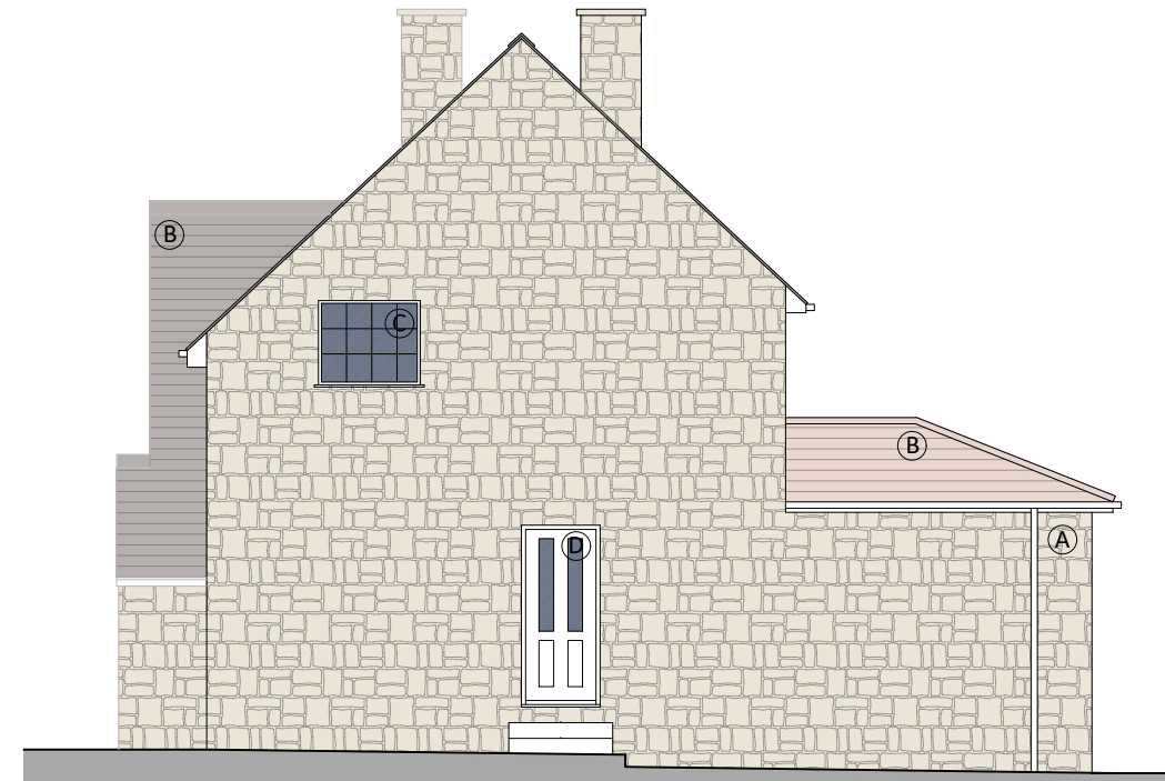
3 SIDE ELEVATION SCALE 1:100