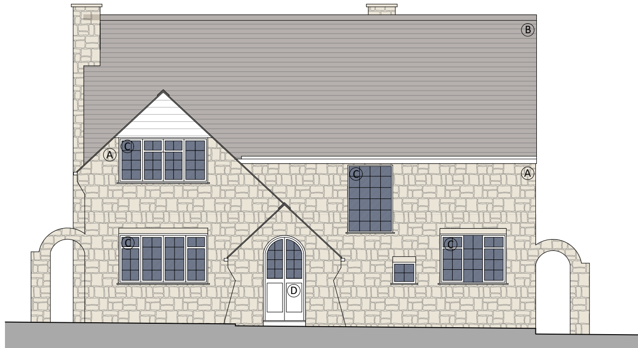
1 FRONT ELEVATION SCALE 1:100