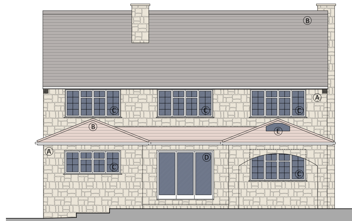
2 REAR ELEVATION SCALE 1:100