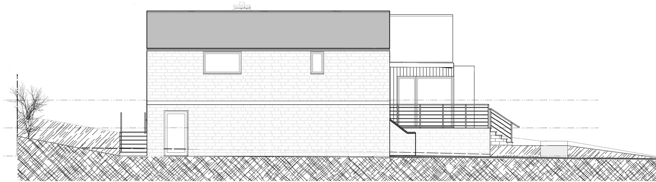
Approved South Elevation