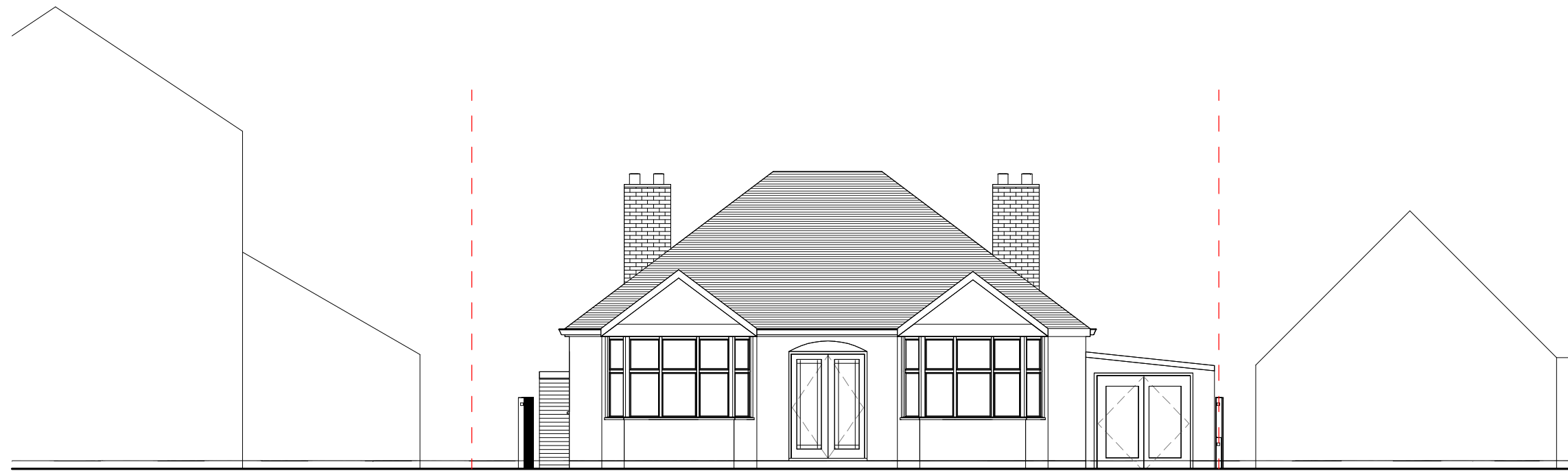
Existing Front Elevation ST 1 : 100

ANY WORK COMMENCING BEFORE APPROVALS HAVE GRANTED IS AT THE RISK OF THE CLIENT AND THE BUILDER..