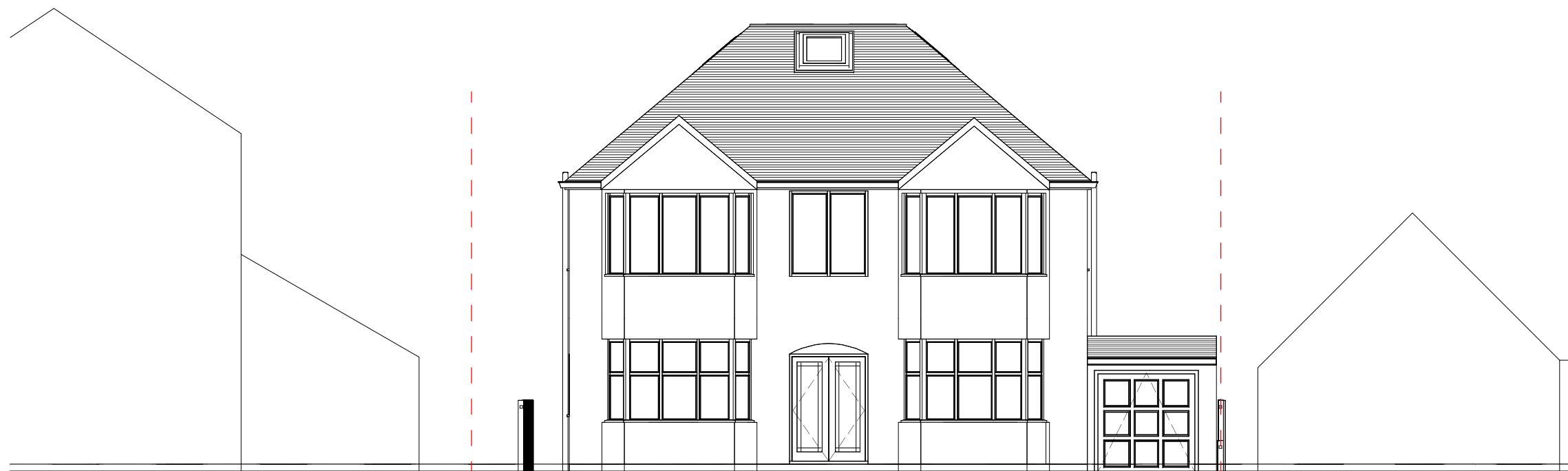
Proposed Front Elevation ST 1 : 100