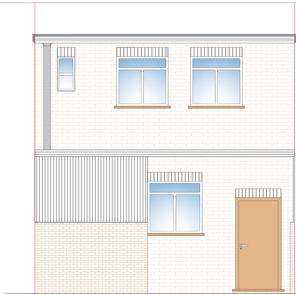
REAR ELEVATION 02_As-Built 1:50