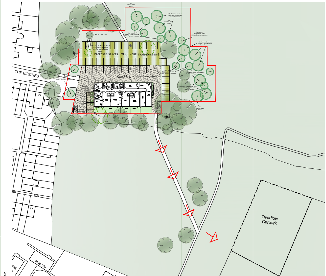
PROPOSED LOCATION PLAN

Notes: Do Not Scale. Use only figured dimensions. All dimensions to be checked on site prior to construction. Any discrepancies to be notified to the architect. All Copyright Reserved to Haskins Designs Ltd.