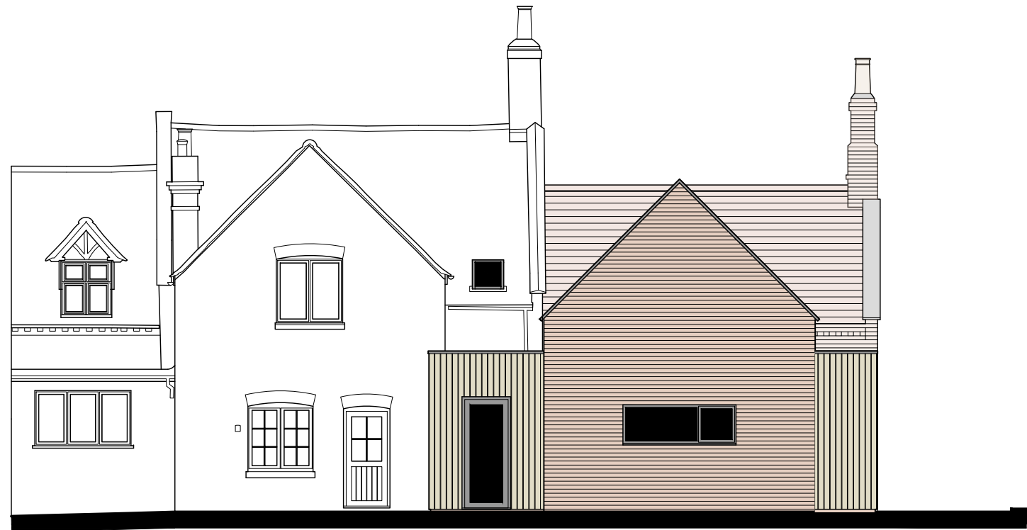
North (Rear) Elevation 1:100