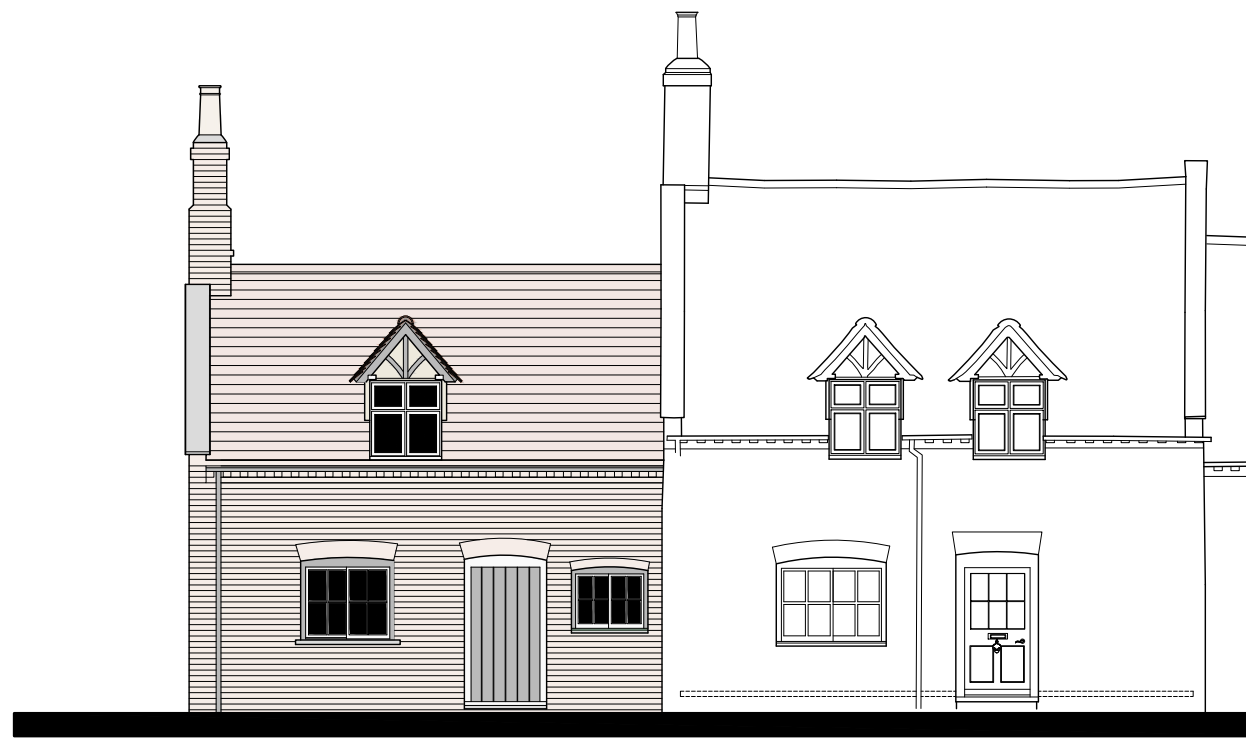
South (Front) Elevation 1:100