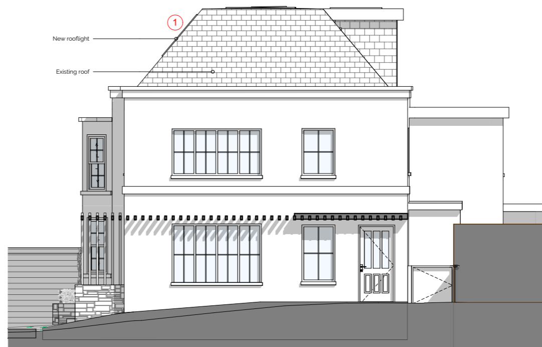
Proposed North West Elevation 1:100