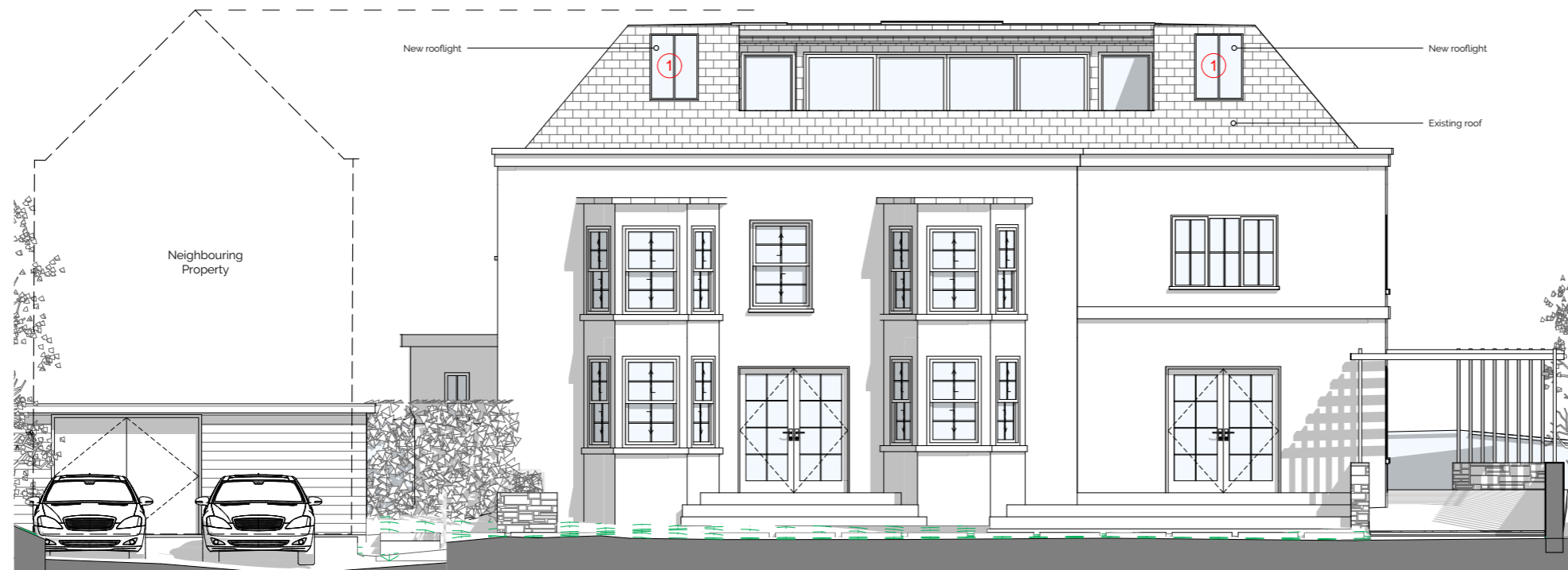
Proposed North East Elevation 1:100