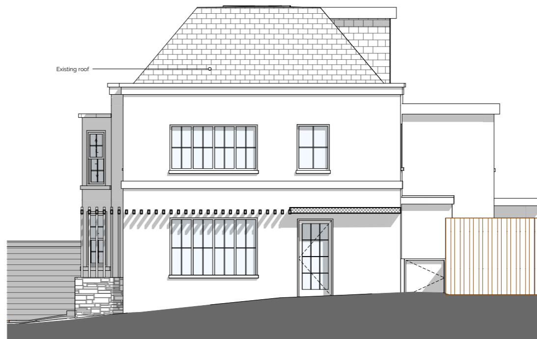
Existing North West Elevation 1:100