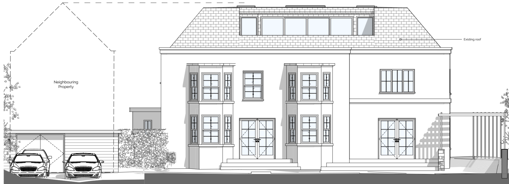
Existing North East Elevation 1:100

© Copyright: Mattinson Associates Ltd. 2023 No reproduction, transmission or correspondence to third parties of all or any part of this document or the information it contains is permitted without the prior written consent of Mattinson Associates Ltd. This drawing is not to be scaled for the purpose of setting out. Any discrepancies found in this drawing, or between this drawing and another must be reported to Mattinson Associates Ltd. immediately.