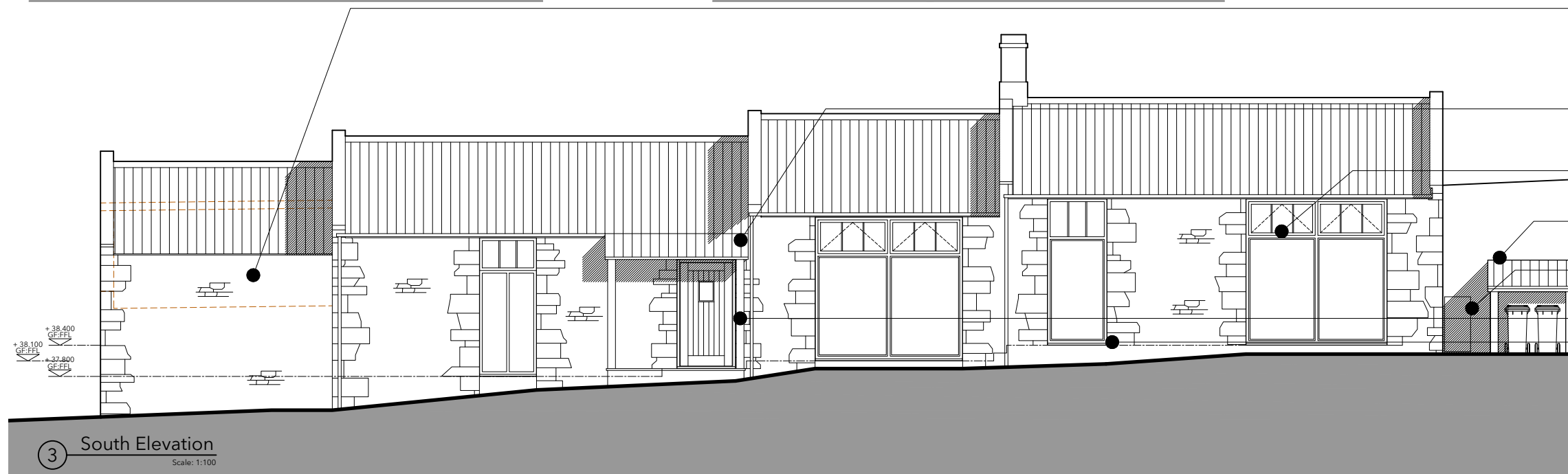
3 South Elevation Scale: 1:100

Proposed powder-coated, thin-framed aluminum, window