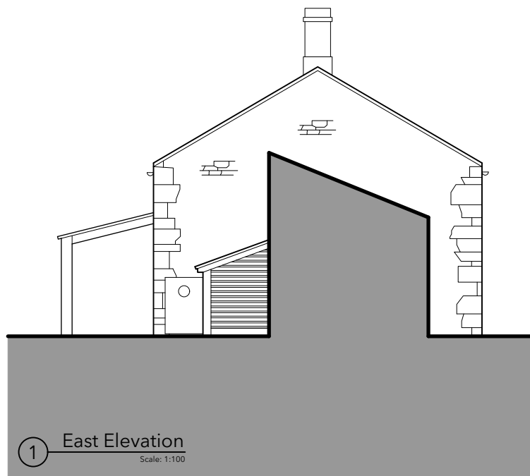
1 East Elevation Scale: 1:100