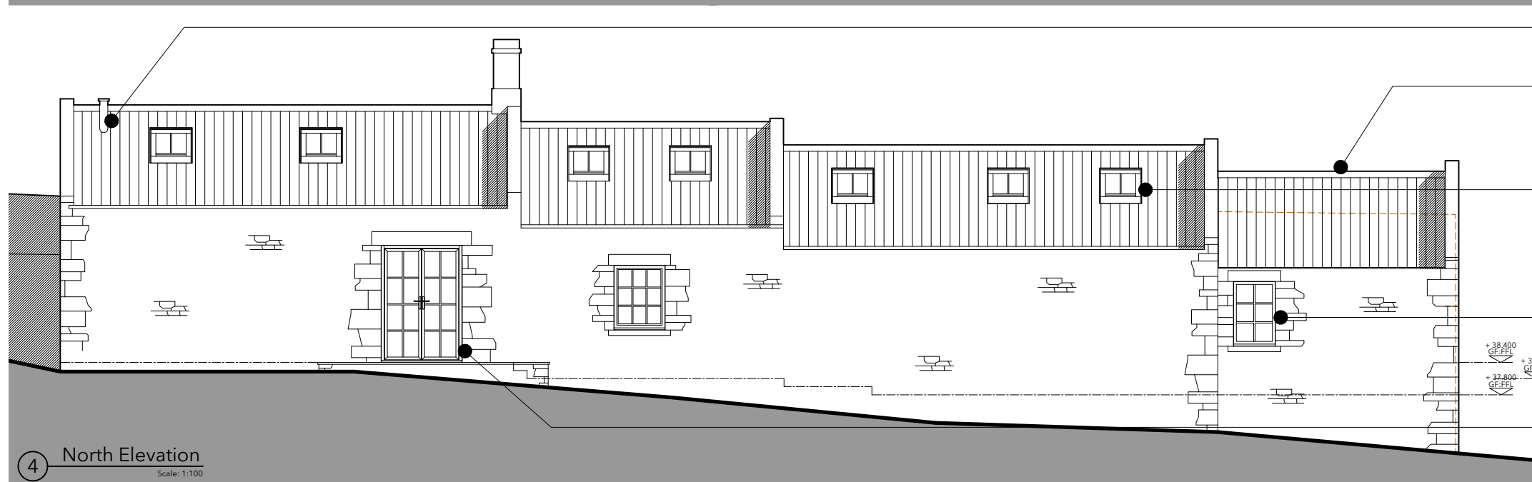
4 North Elevation Scale: 1:100

Proposed powder-coated, thin-framed aluminum, windows