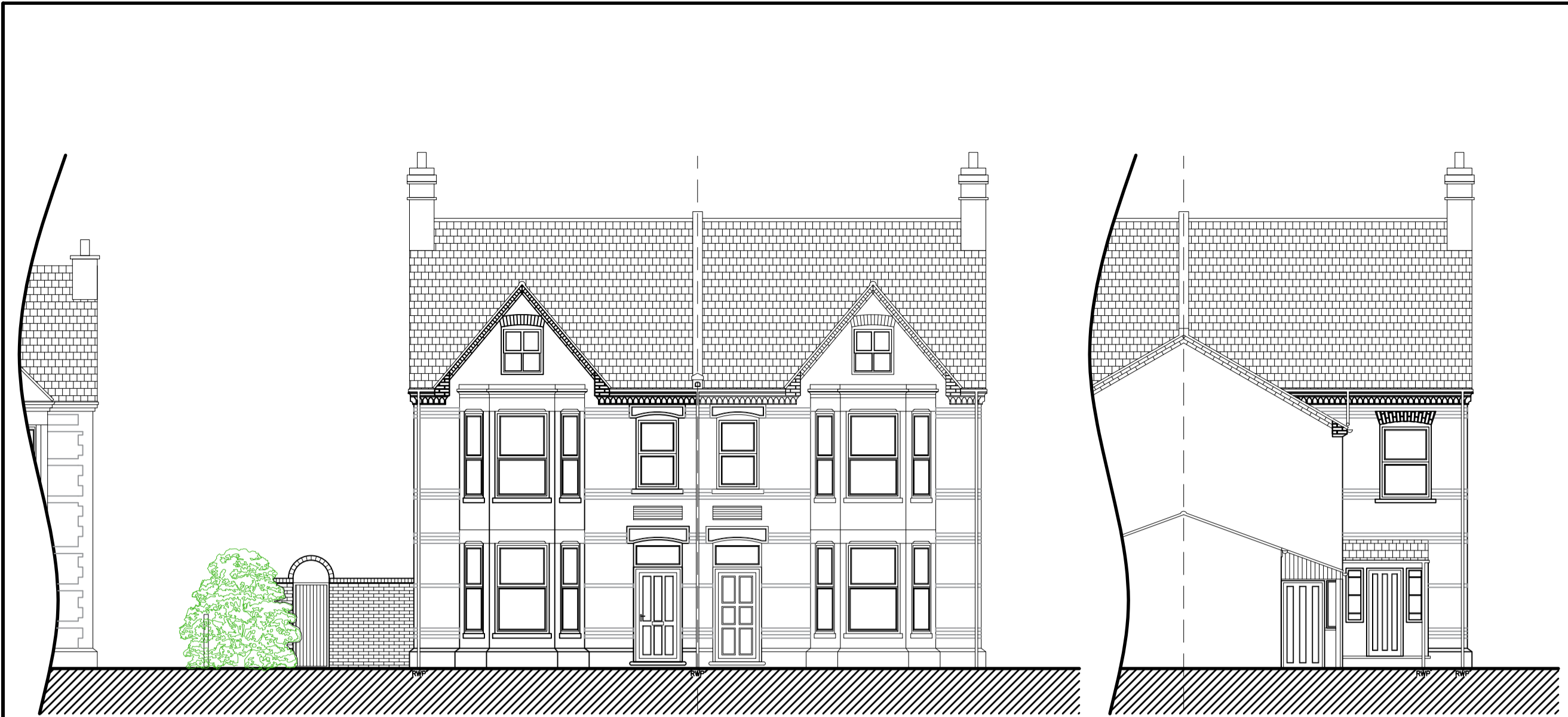
EXISTING FRONT ELEVATION / STREET SCENE (1:100)