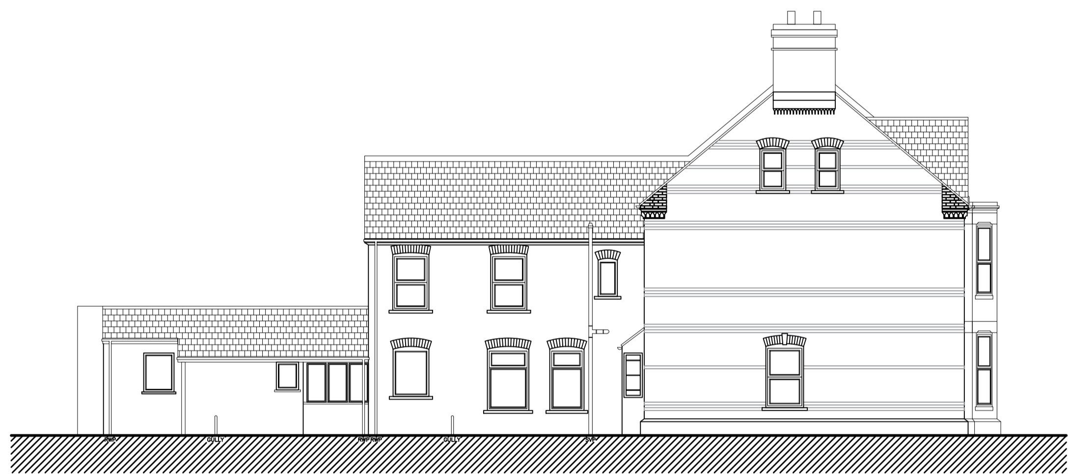
EXISTING LHS ELEVATION (1:100)