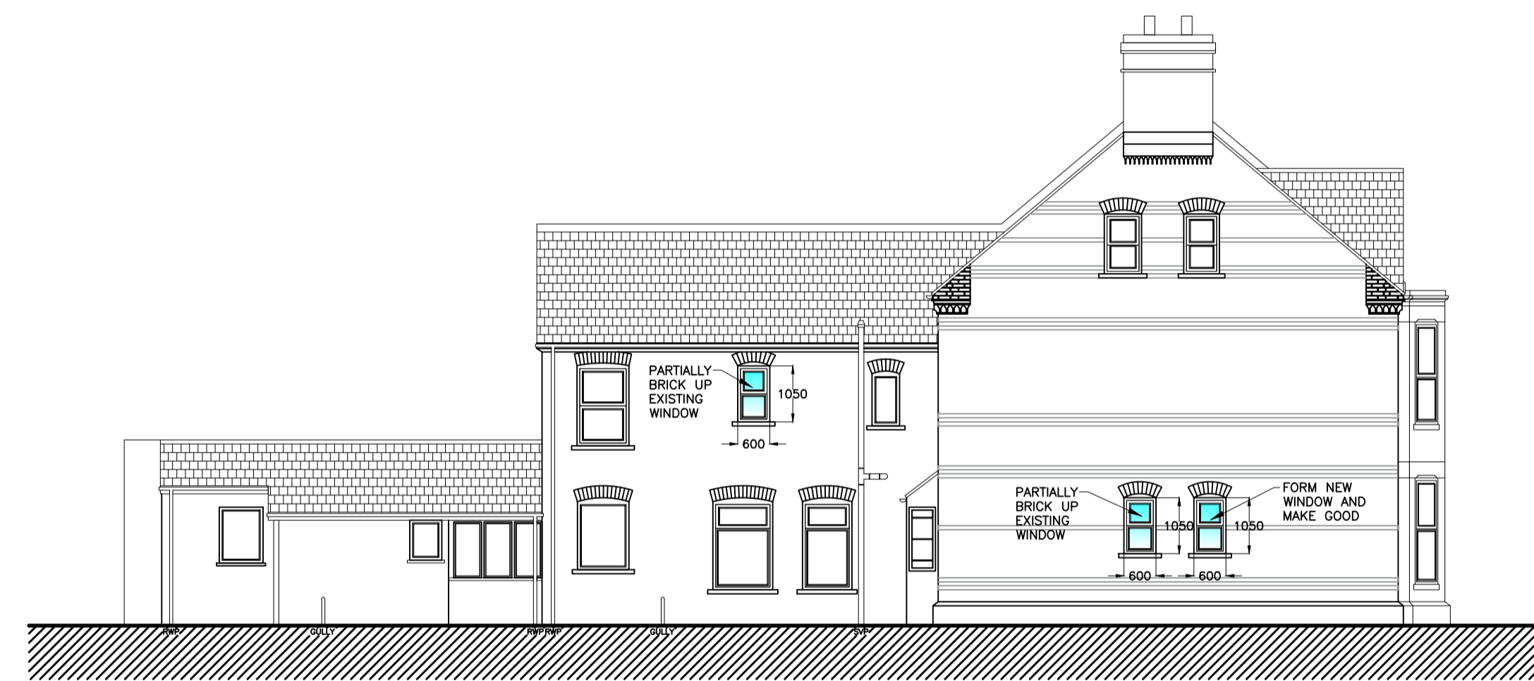
PROPOSED LHS ELEVATION (1:100)