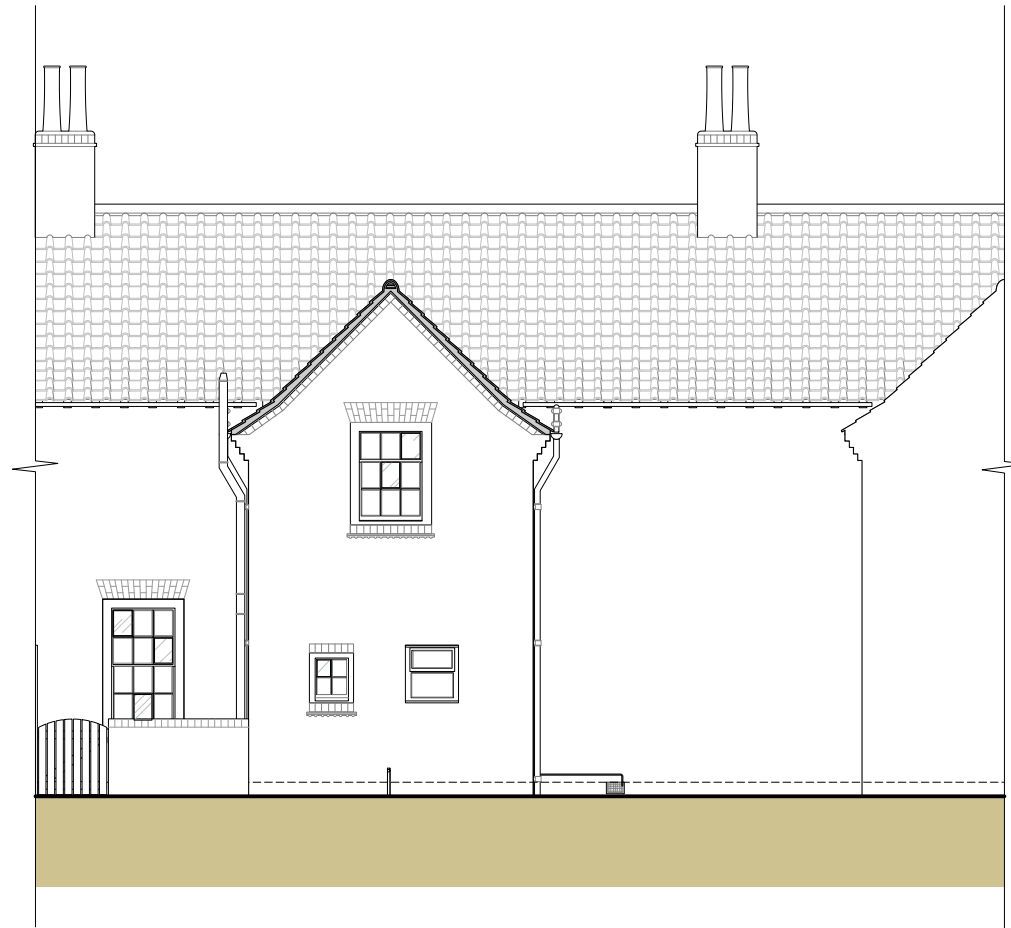
3 WESTERN ELEVATION Scale: 1:100