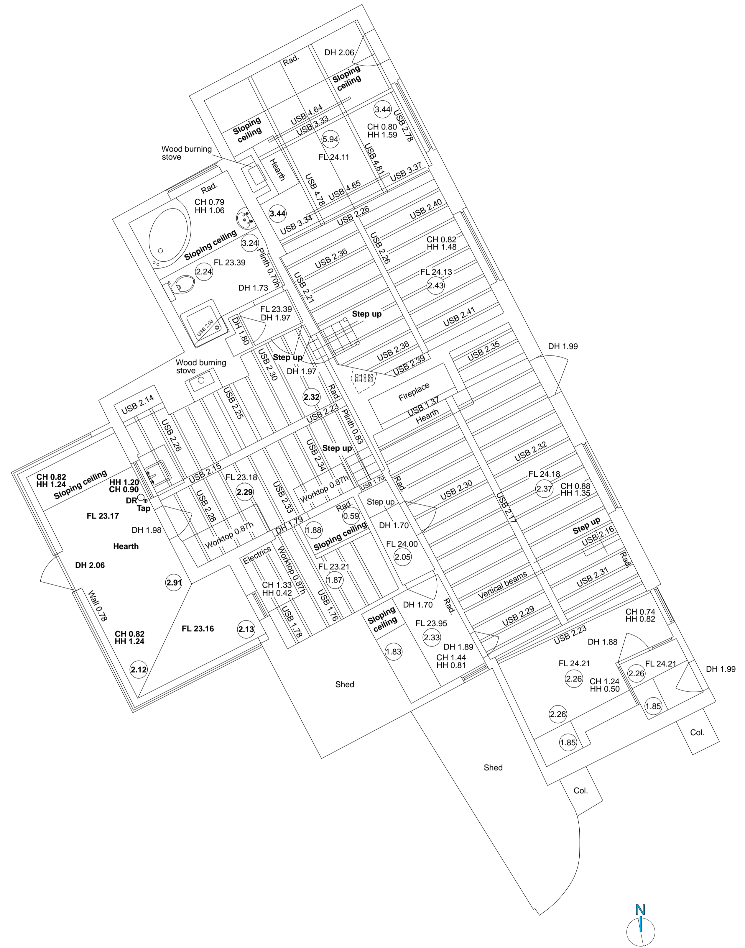
1 GROUND FLOOR PLAN SPREAD EAGLE HOUSE Scale: 1:50