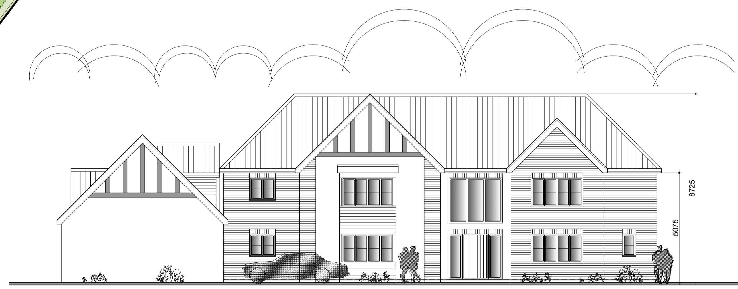
1:100 Indicative Front Elevation (North East)