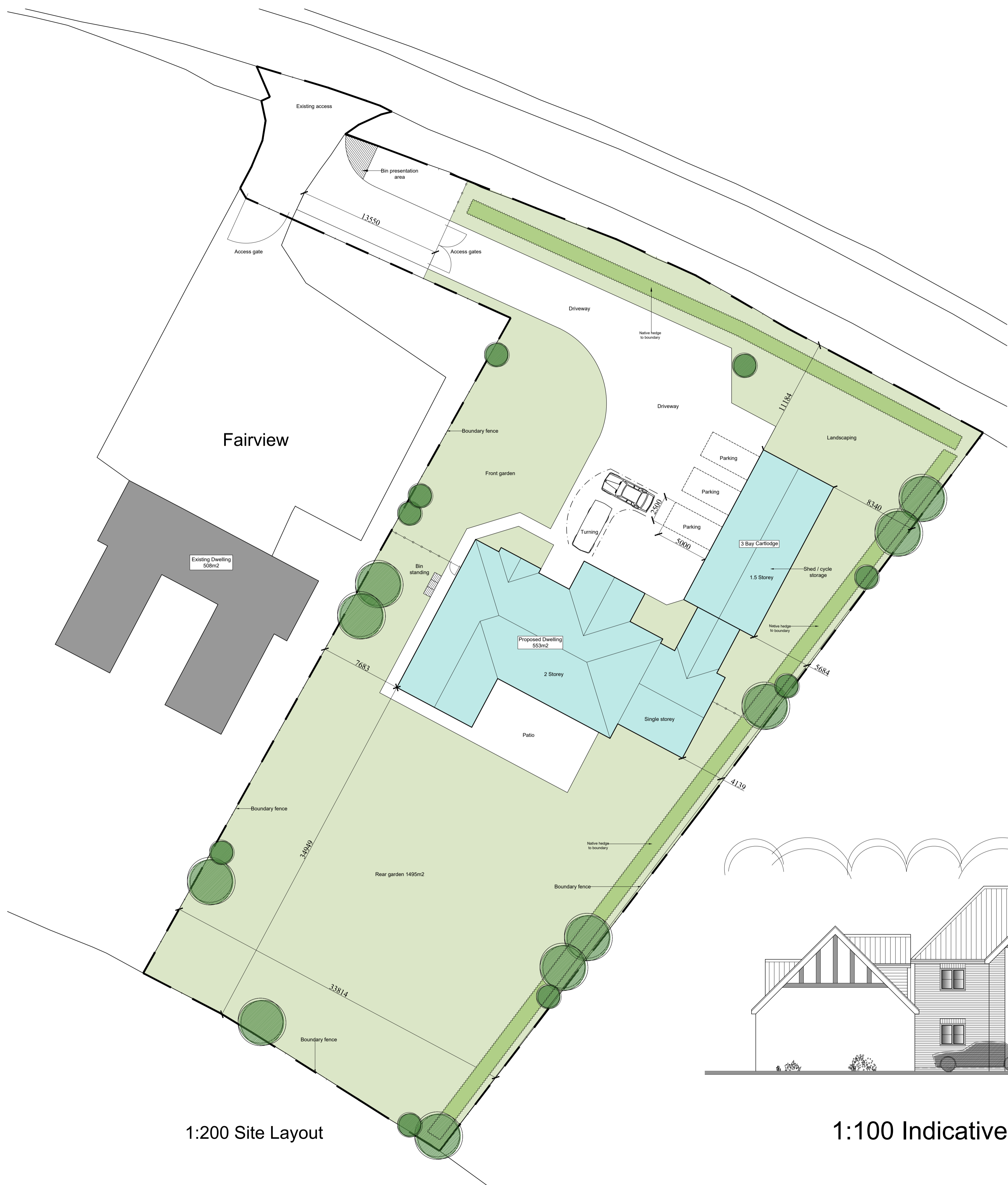
1:200 Site Layout