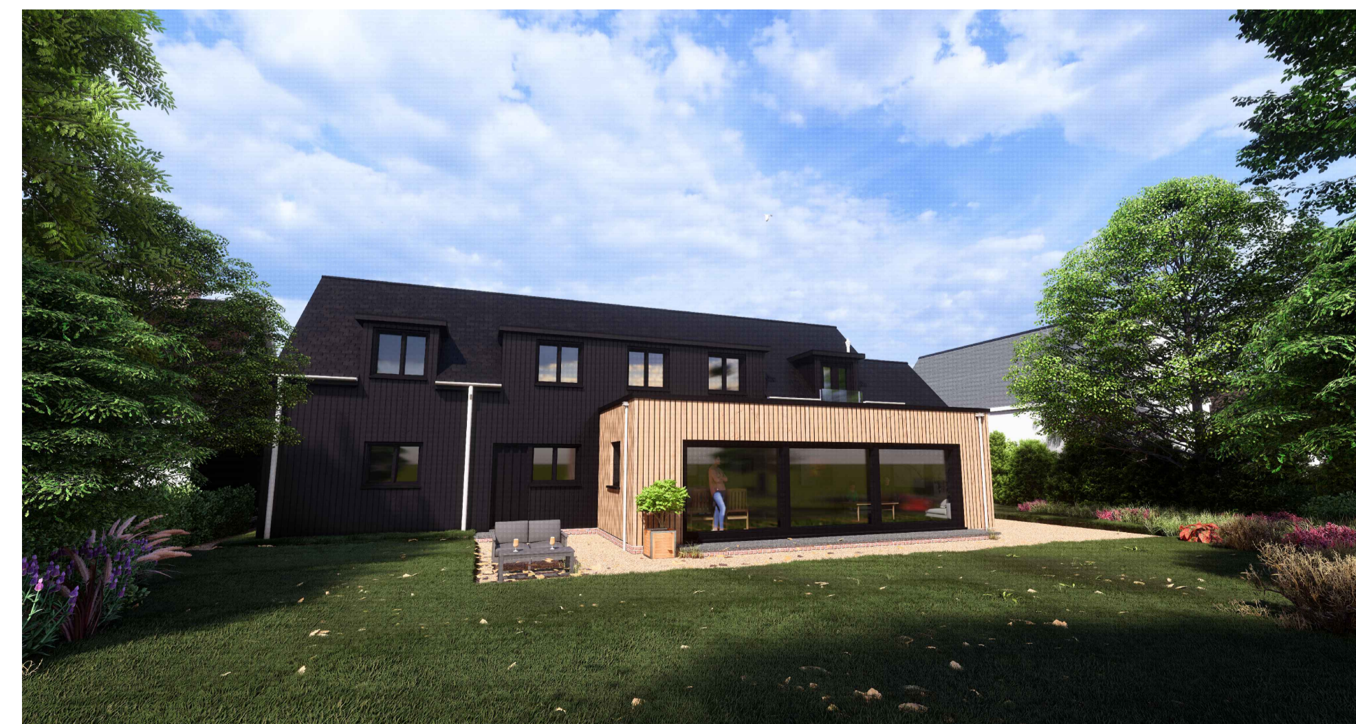
Rear Elevation Visual

Rev H: 26.09.23 - Drawing & 3d Images Updated