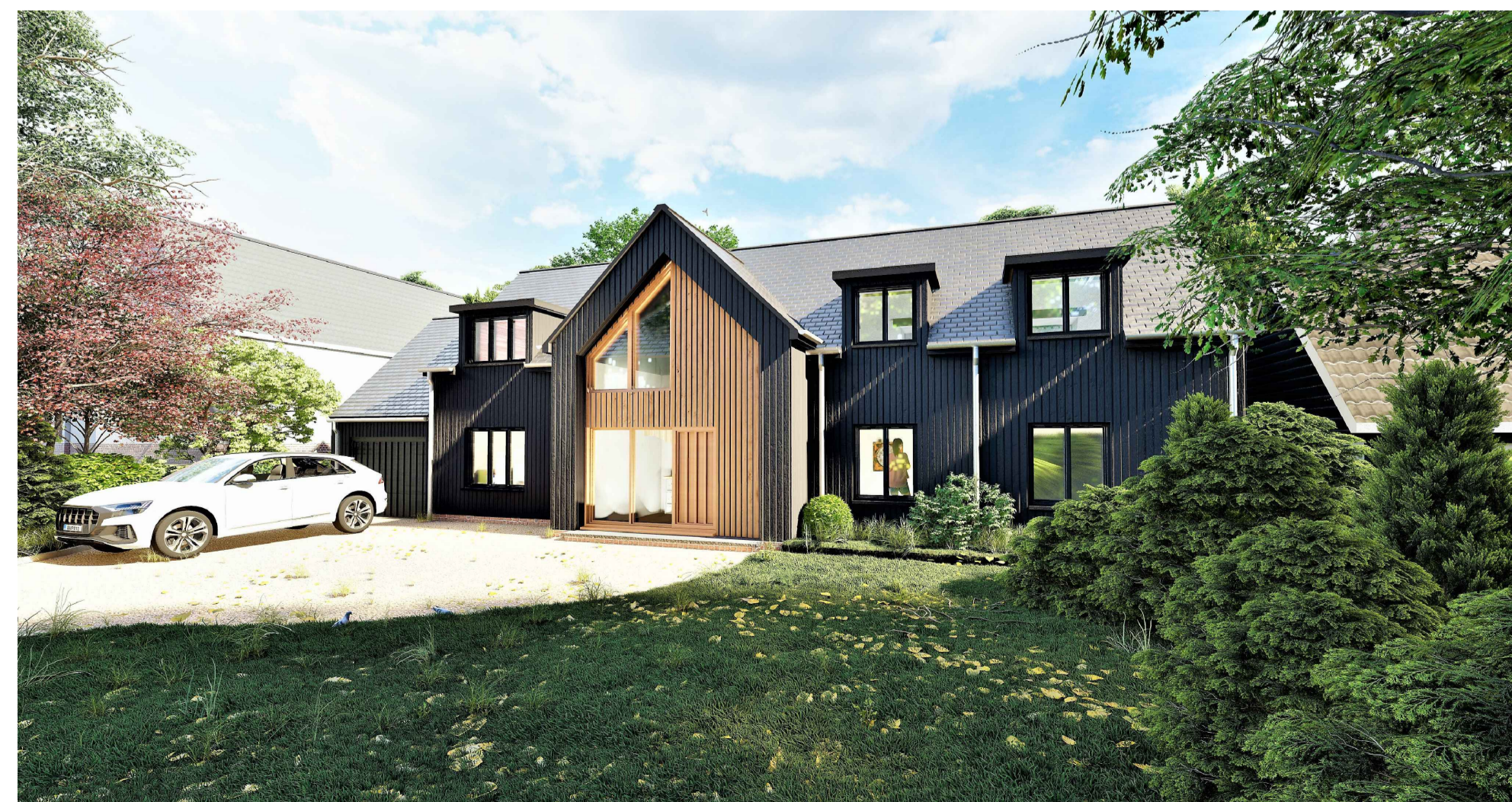
Front Elevation Visual