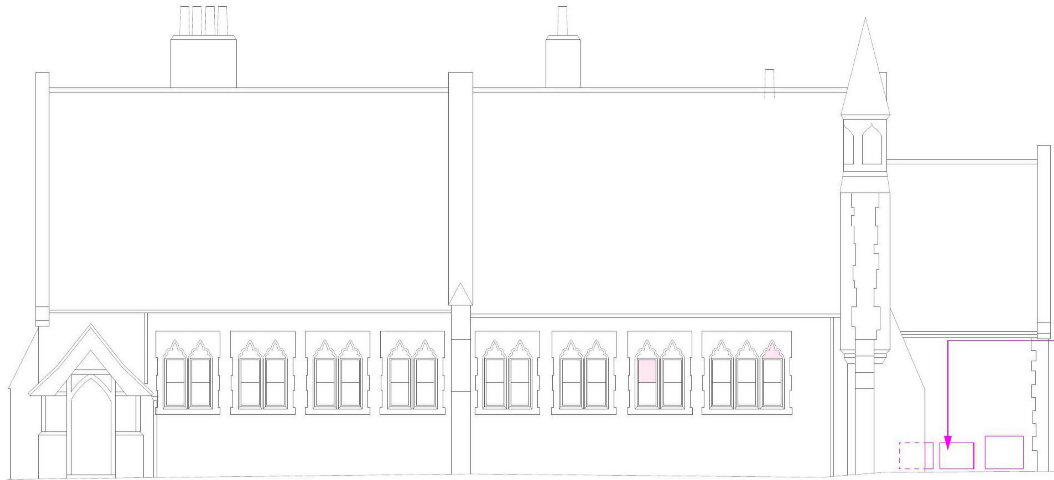
EXISTING/PROPOSED NORTH ELEVATION