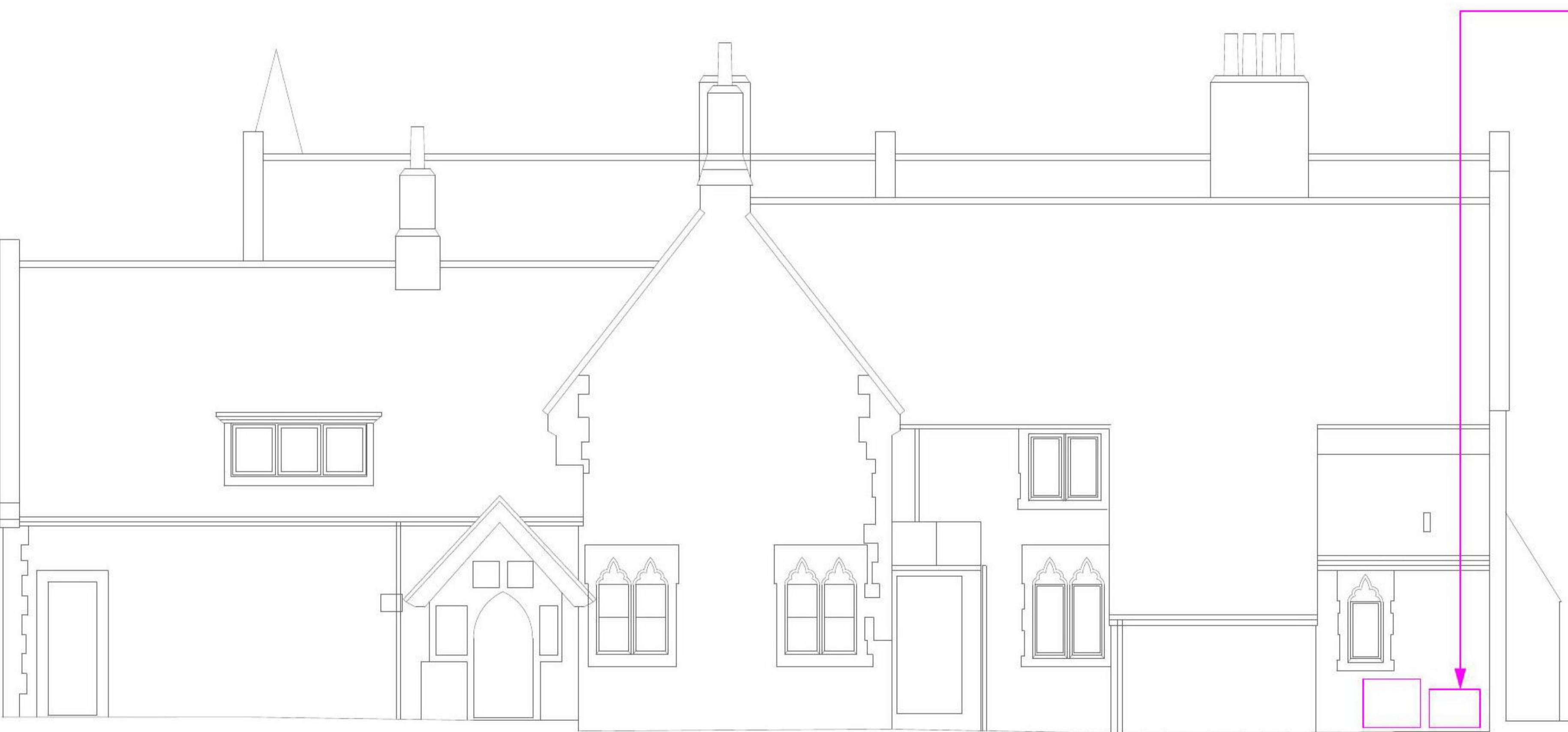
EXISTING/PROPOSED SOUTH ELEVATION

DISCLAIMER © Forest Architecture Limited 2023