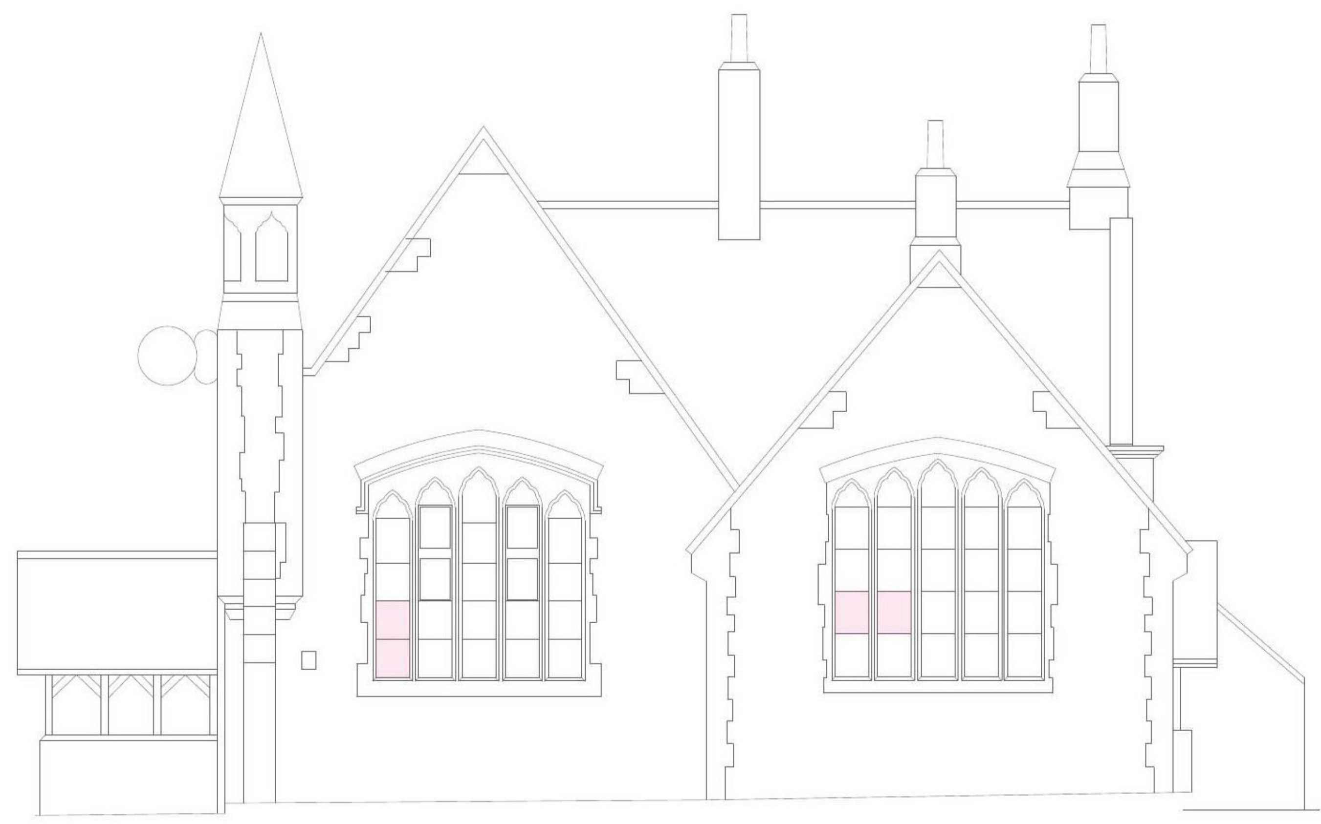
EXISTING/PROPOSED WEST ELEVATION