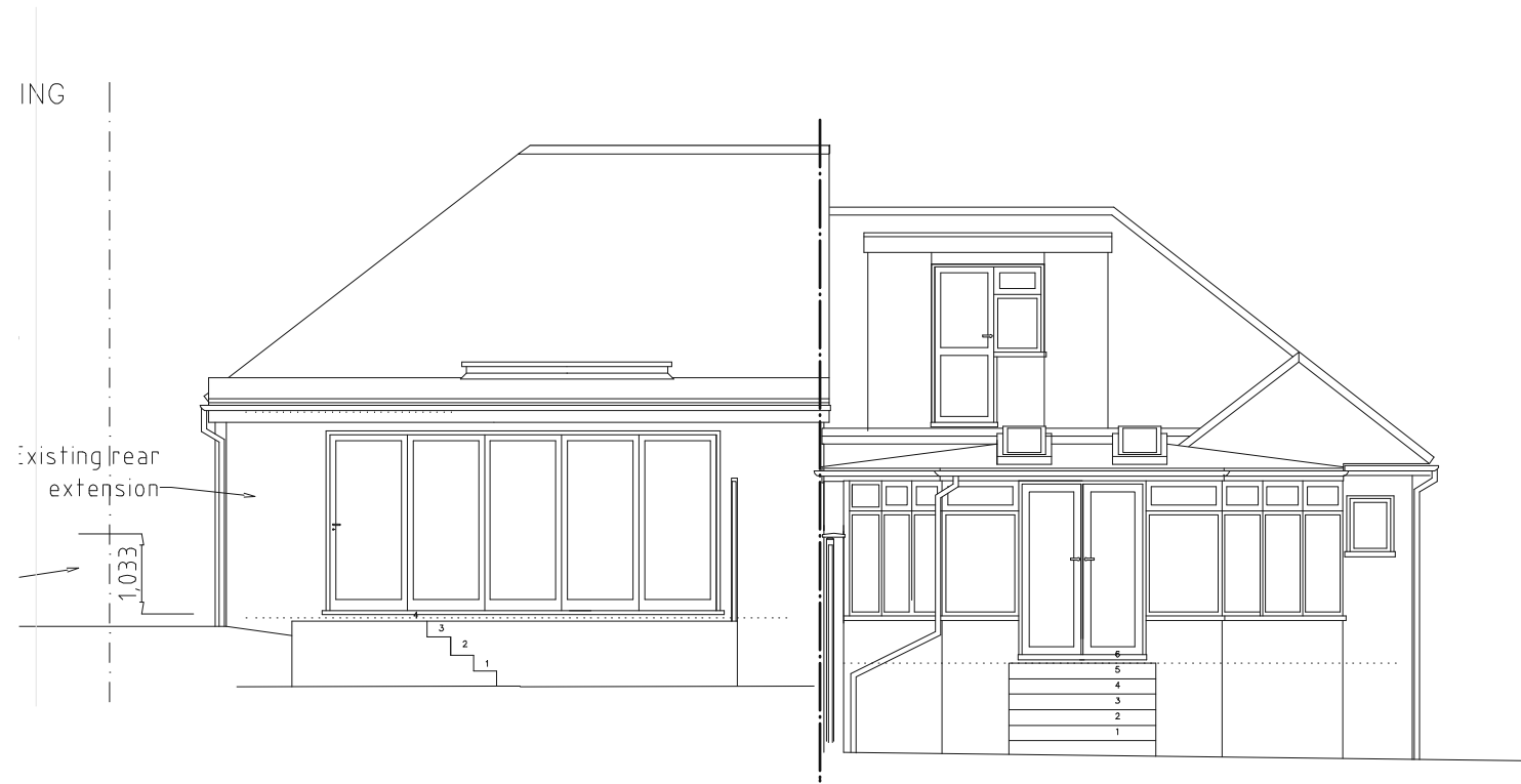
02 Pre Existing Rear Elevation 1:100 @ A3