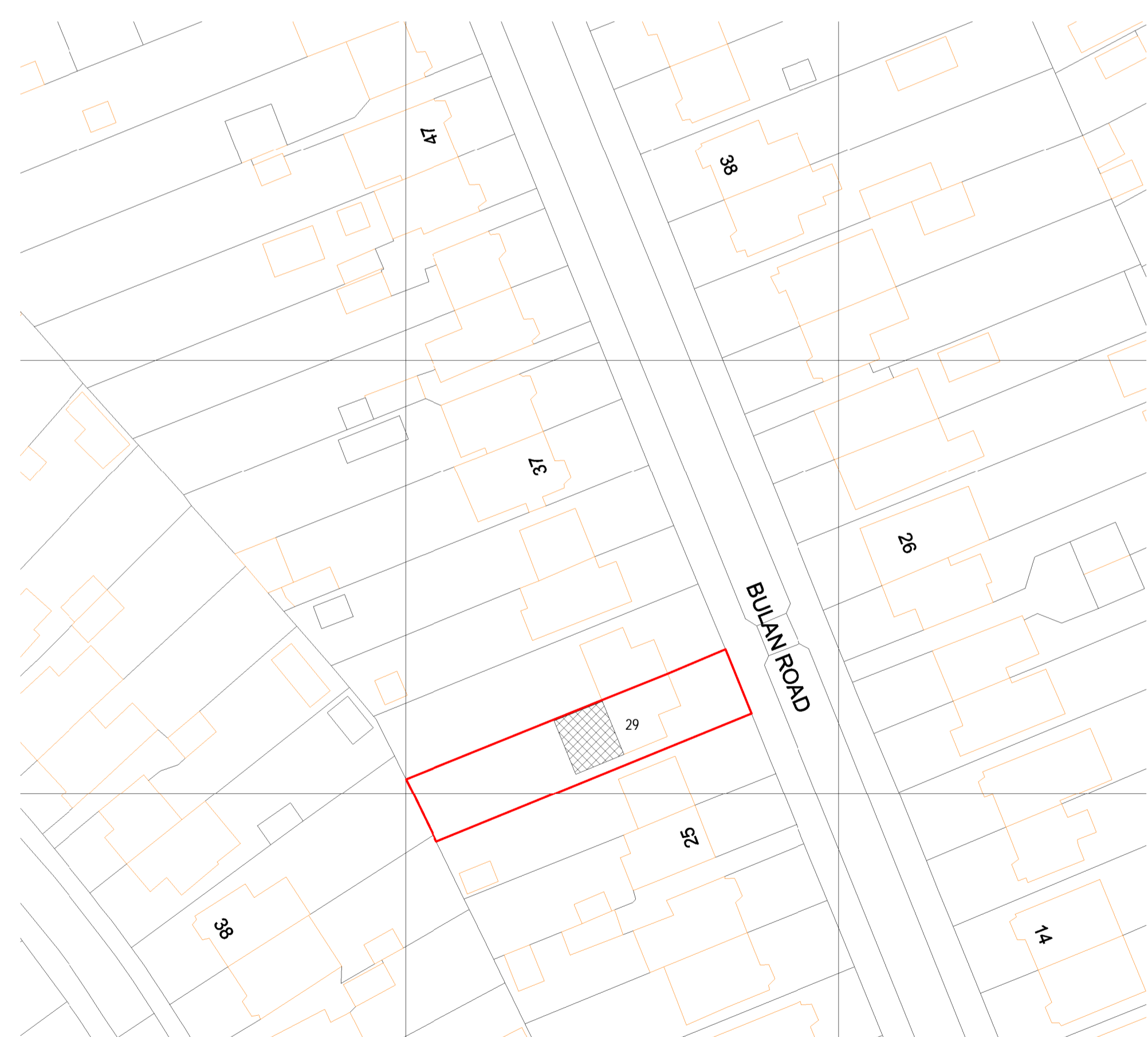
3 Proposed - Block Plan PD 1 : 500