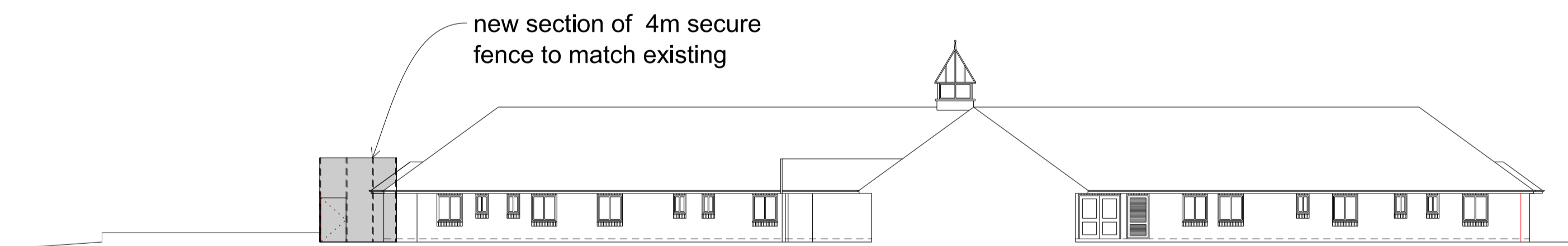
east sectional elevation fence to Ashurst Ward - proposed

new section of 4m secure fence to match existing