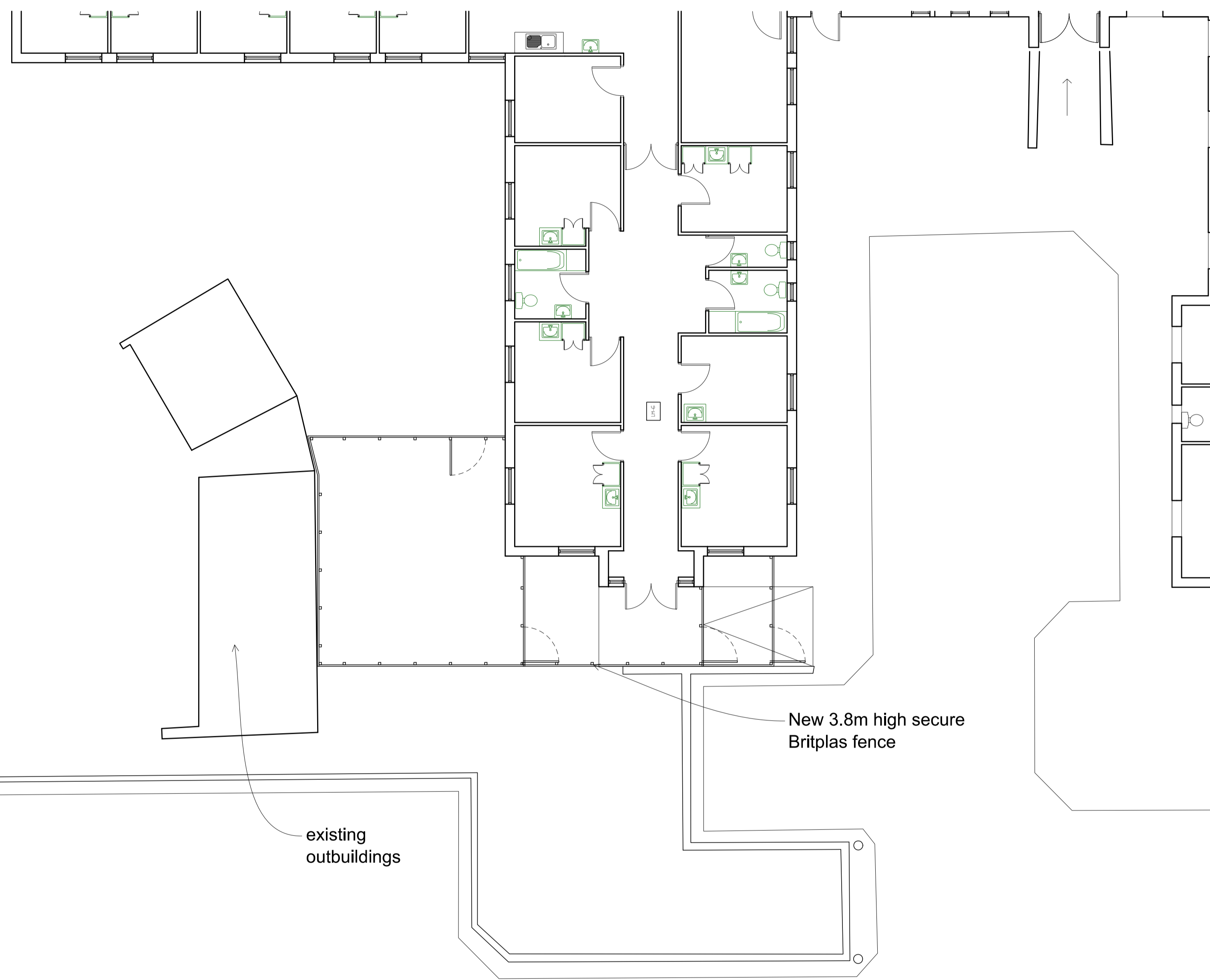
Proposed Plan - new secure fence to front