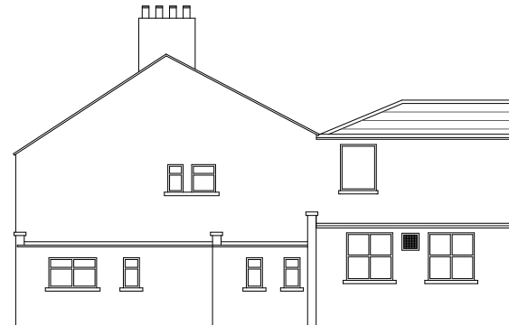
EAST SIDE ELEVATION