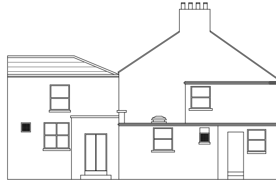
WEST SIDE ELEVATION