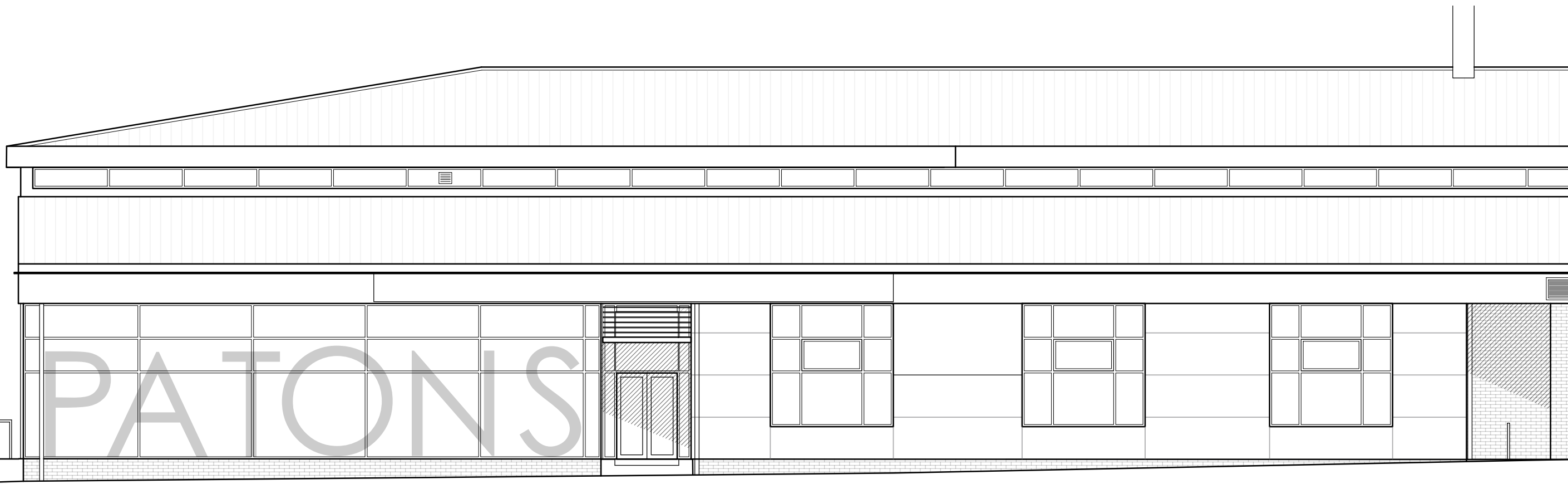
SOUTH ELEVATION AS PROPOSED (NO CHANGES)