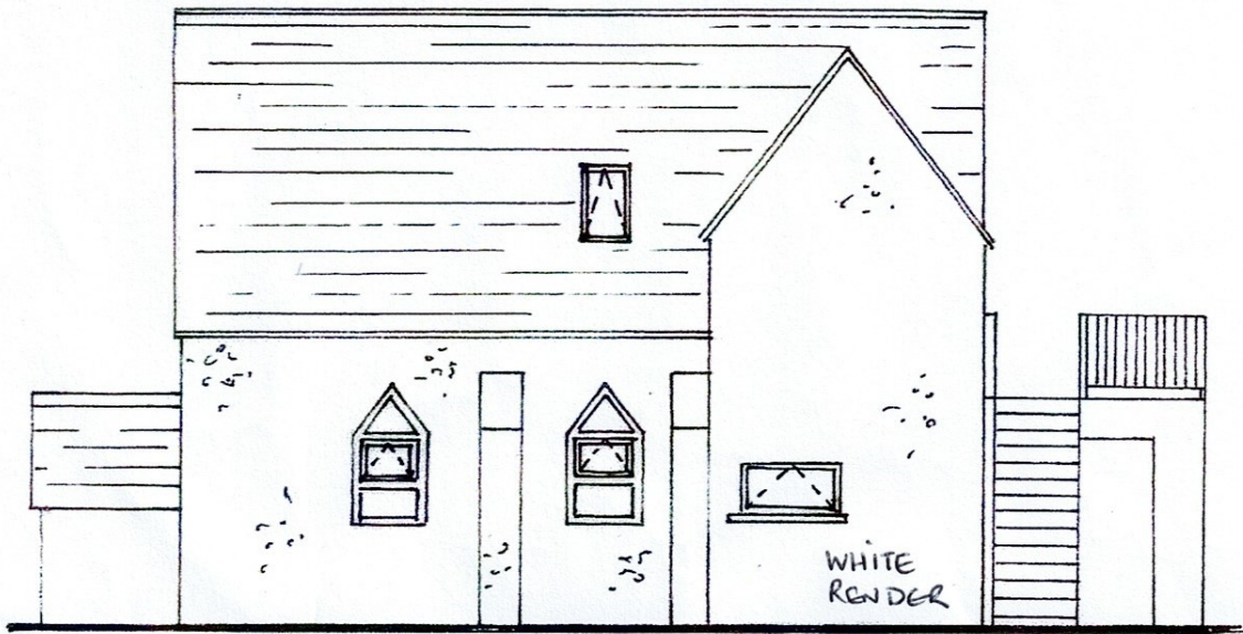
·SIDE ELEVATION (EXISTING)·