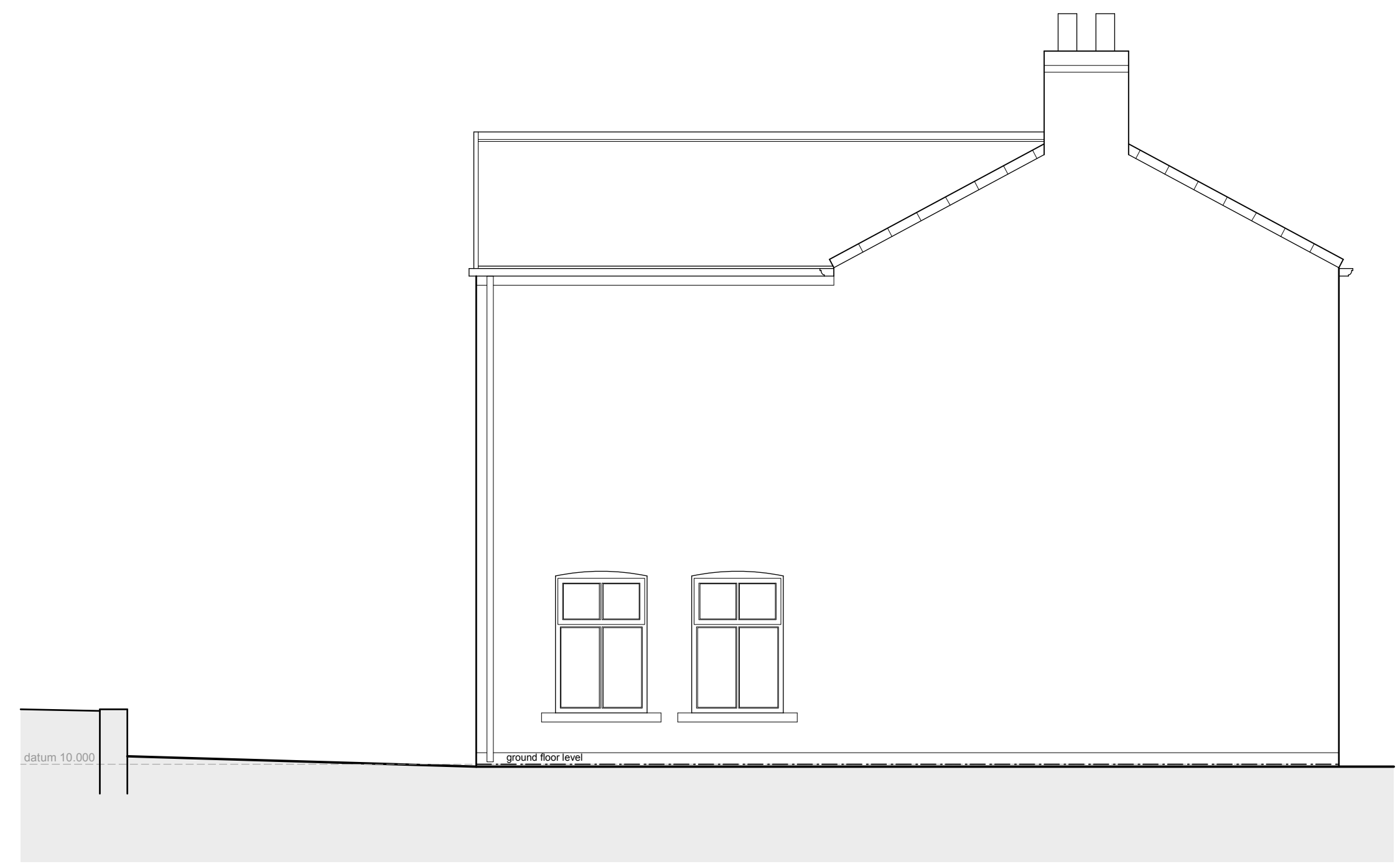
side elevation - east