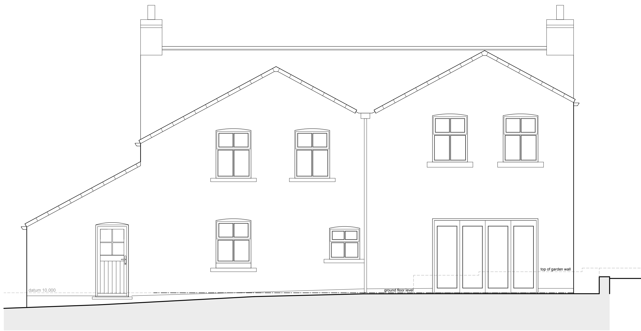
rear elevation - south