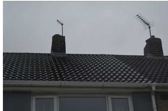
Figs. 3 & 4 External roof detail – no gaps/crevices present

The roof overhang/eaves detail were all fully sealed, these tightly fitting to brickwork and render (Figs. 5 and 6 - overleaf)