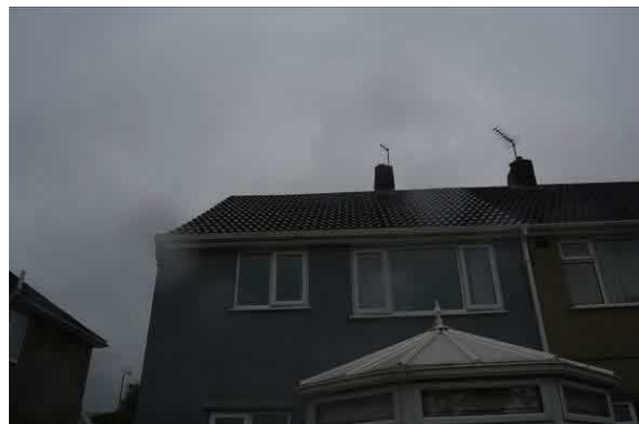
Figs. 1 & 2 64 Pastures Hill

The property was set on a large plot with formally landscaped front and rear gardens. Residential houses and gardens along with roads dominated surrounding habitats.