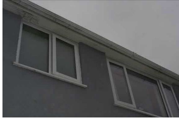
Figs. 5 & 6 UPVC Eaves fully sealed with no gaps/crevices present