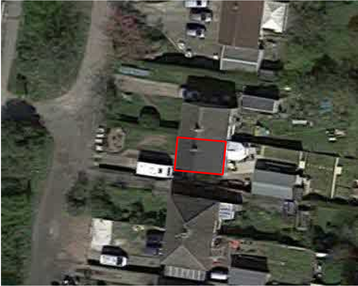
26 Warsop Lane, Rainworth