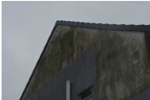
Fig. 7 Gable end with tightly fitting dry verge cover

Internally, the inspection revealed a single large roof void, this was lined with tightly fitting Breathable Roof Membrane (Figs. 8 and 9).