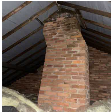
Figs. 8 & 9 Roof void lined with BRM

No light penetration was observed anywhere within the roof void, which was evidently fully sealed internally.