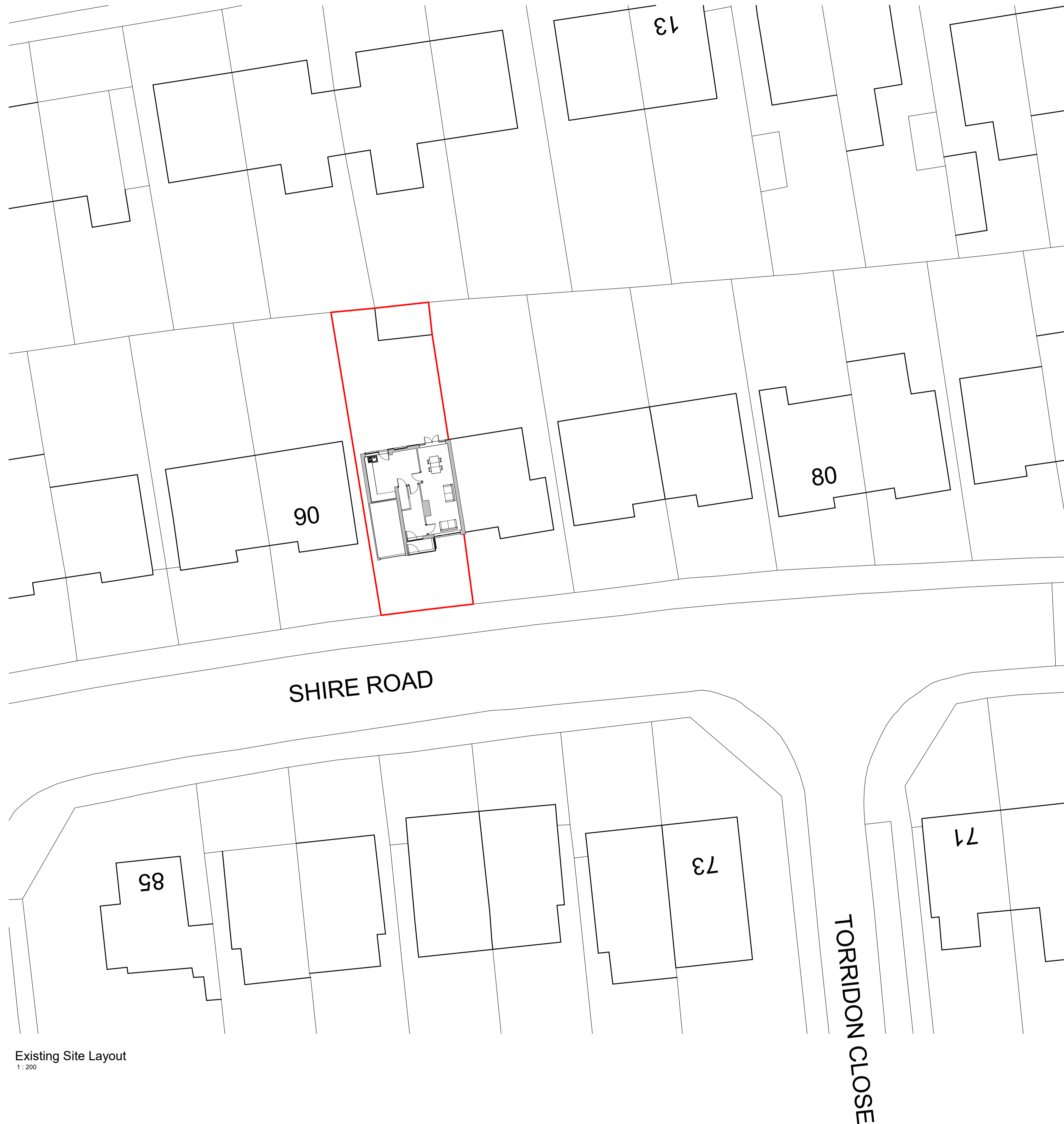
Existing Site Layout 1:200