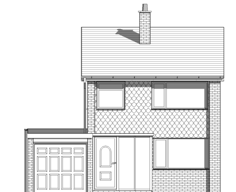
Existing Front Elevation 1 : 100 South