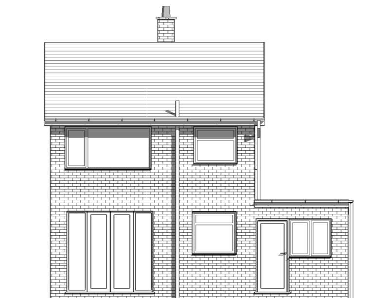
Existing Rear Elevation 1 : 100 North