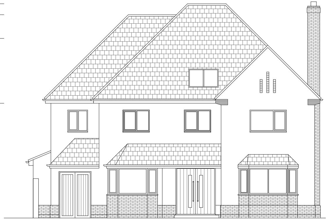
proposed front elevation