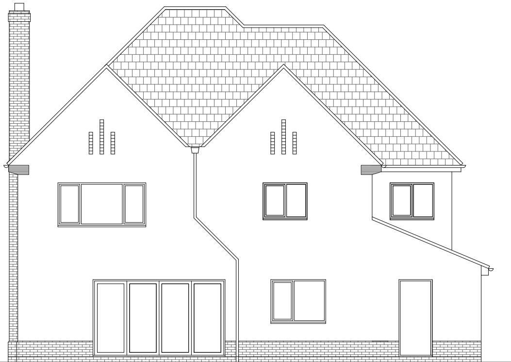
proposed rear elevation (no change)