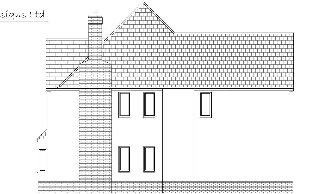
proposed side elevation - NO CHANGE