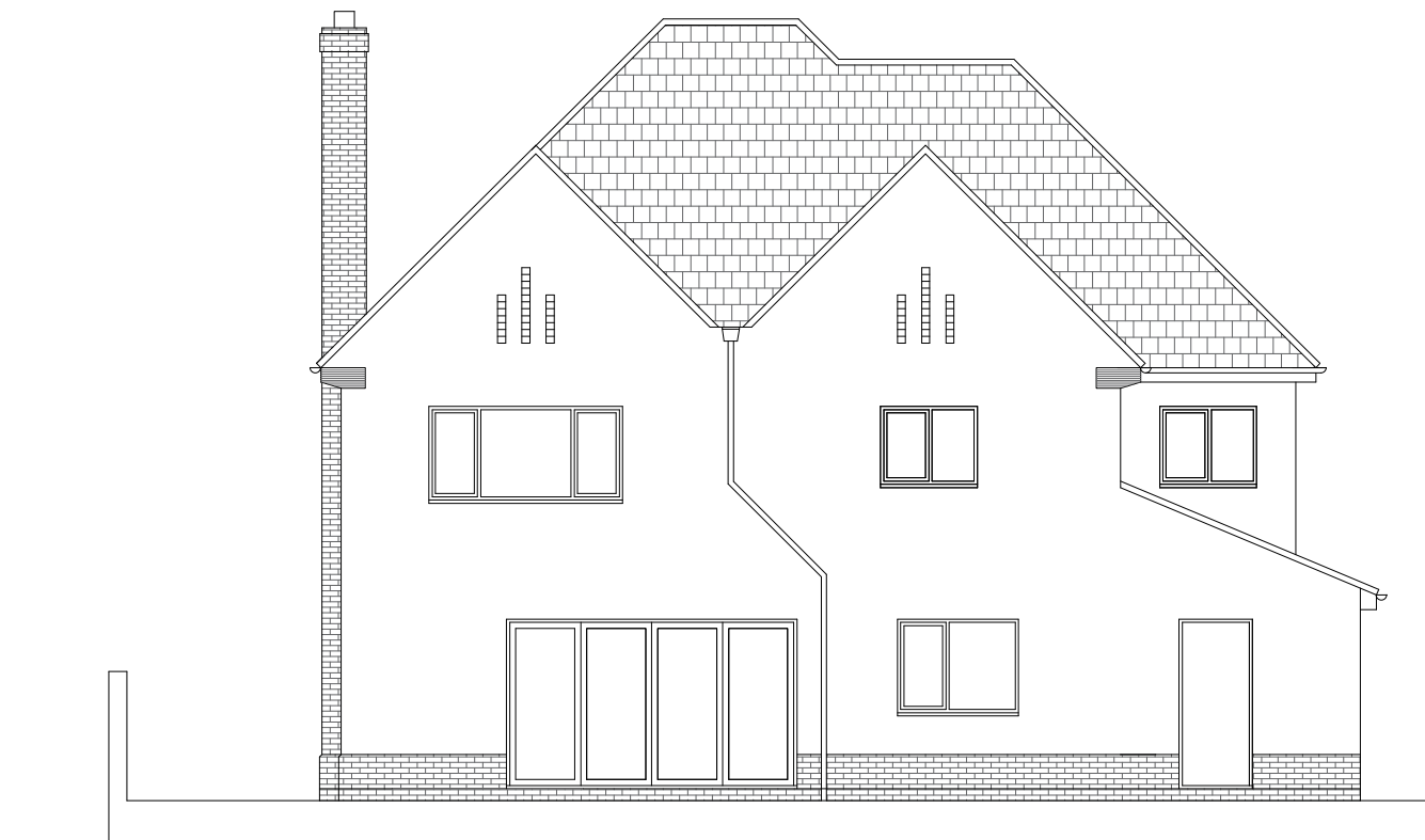
proposed rear elevation (no change)