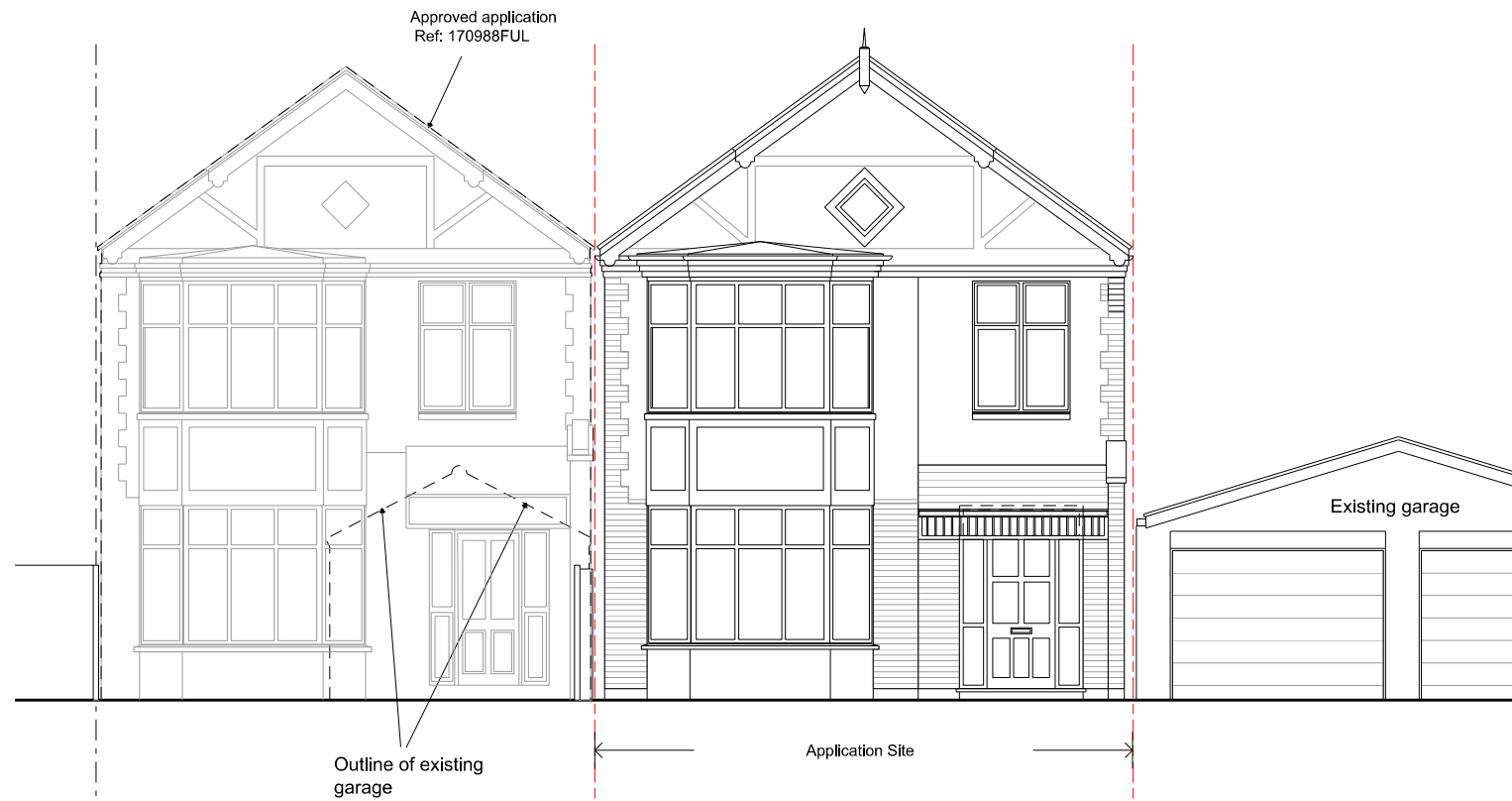
01 PROPOSED - West Elevation (Front) SCALE 1:100