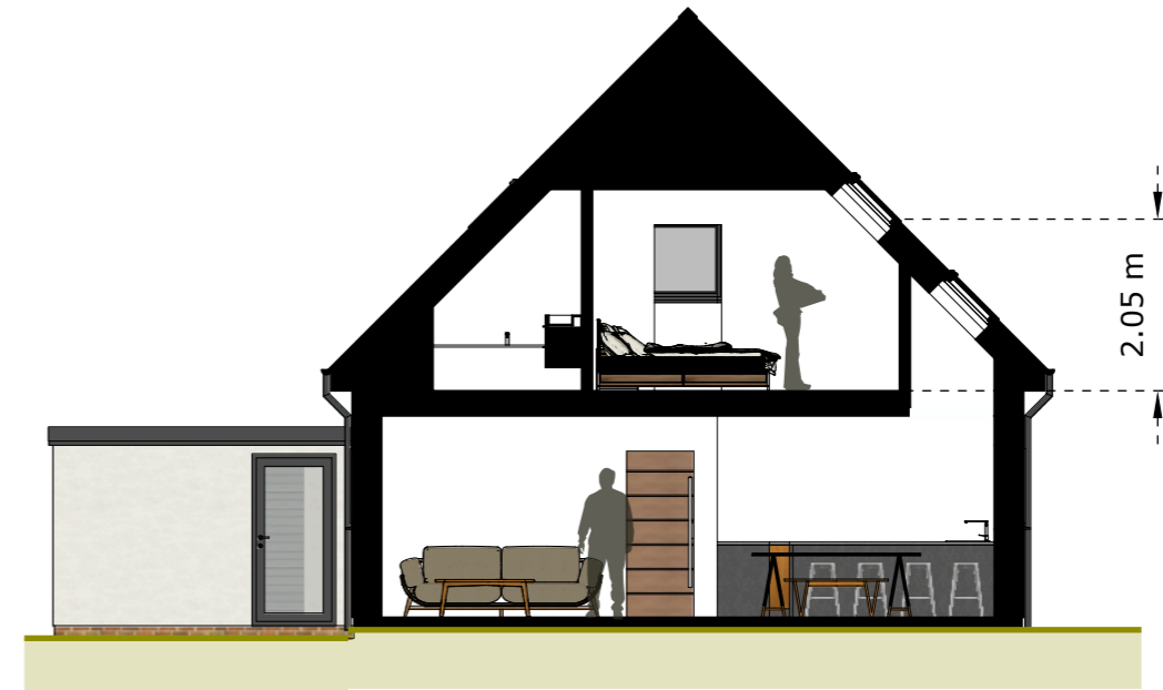
SECTION 1/A3. SCALE 1:100