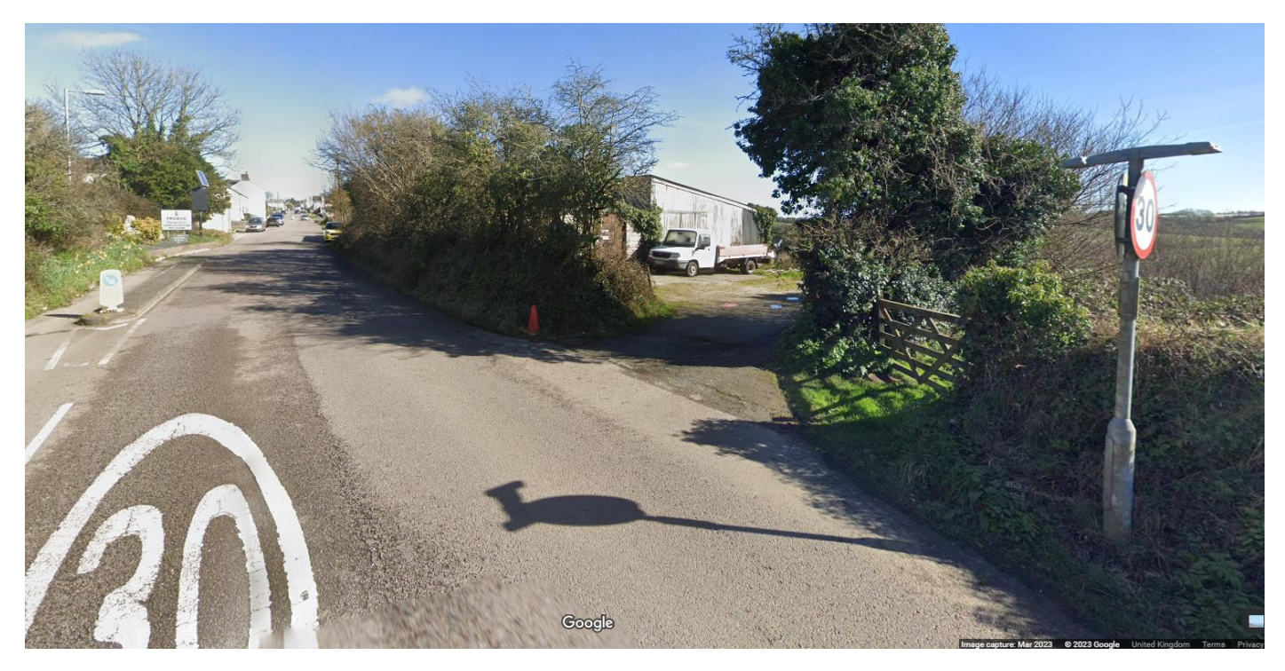
Fig 1: Existing site access to be retained.

The site is located on the outside edge of the Probus Village accessed via. existing entrance off Fore Street.