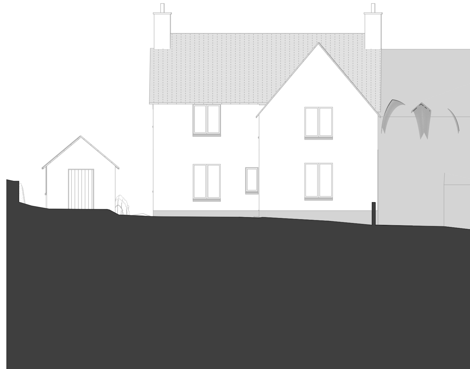
E-01 Existing South Elevation 1:100