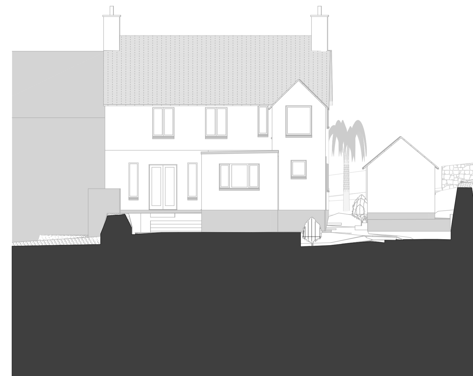
E-03 Existing North Elevation 1:100

Job Title 1 Coastguard Cottages Treen - TR19 6LQ Alterations and Extension For Anna & Chris Haynes