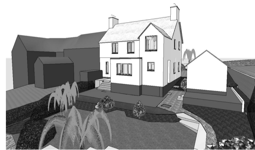
3D View - Rear 1:400