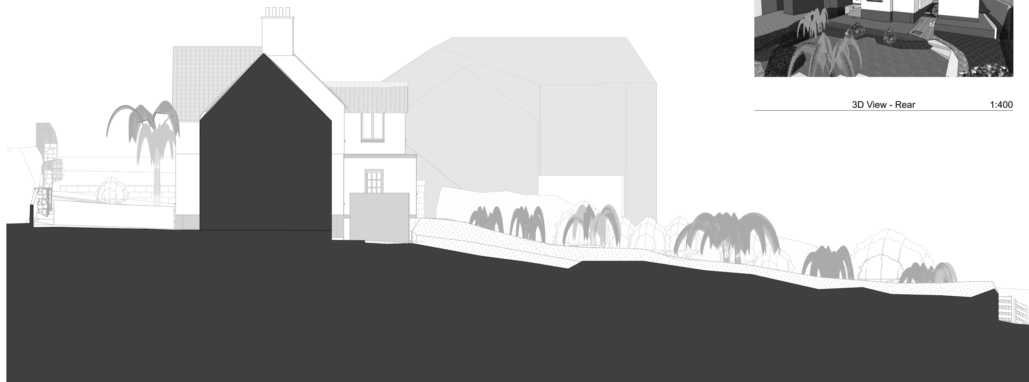
E-04 Existing East Elevation 1:100