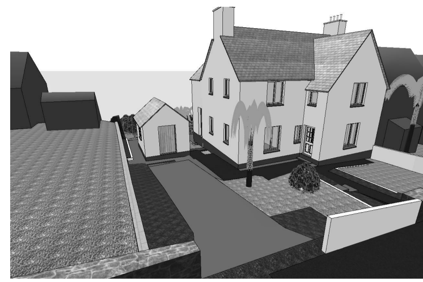
3D View - Front 1:400