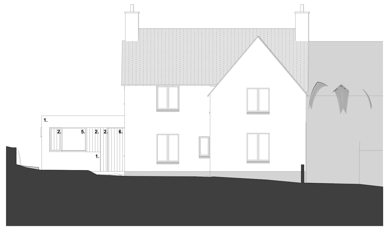
E-01 Proposed South Elevation 1:100