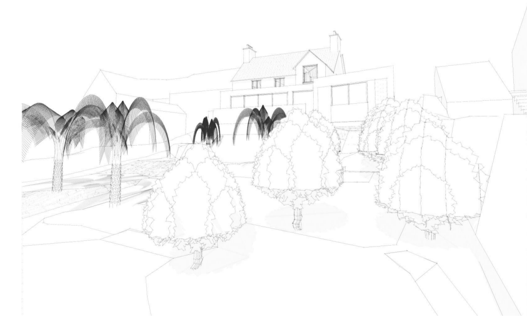
Rear (North) As Proposed