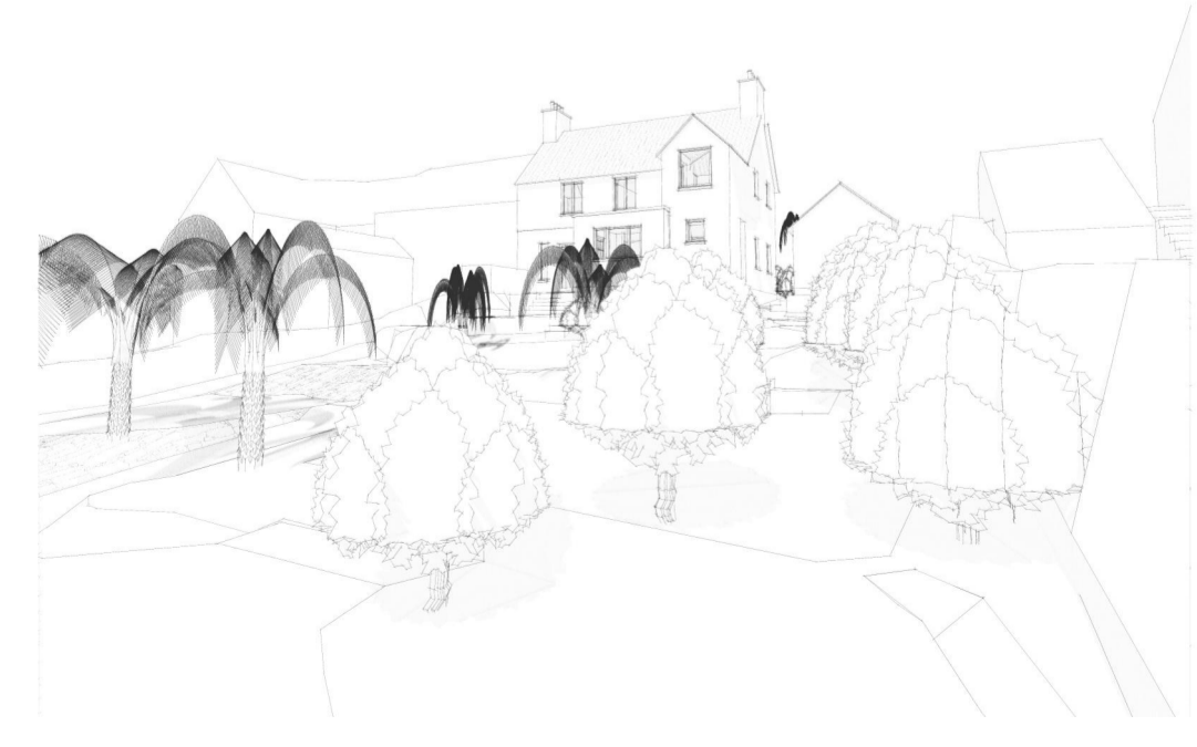
Rear (North) As Existing