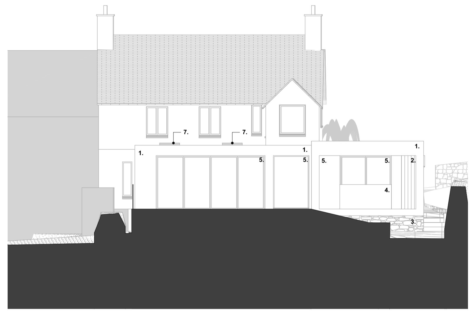
E-03 Proposed North Elevation 1:100