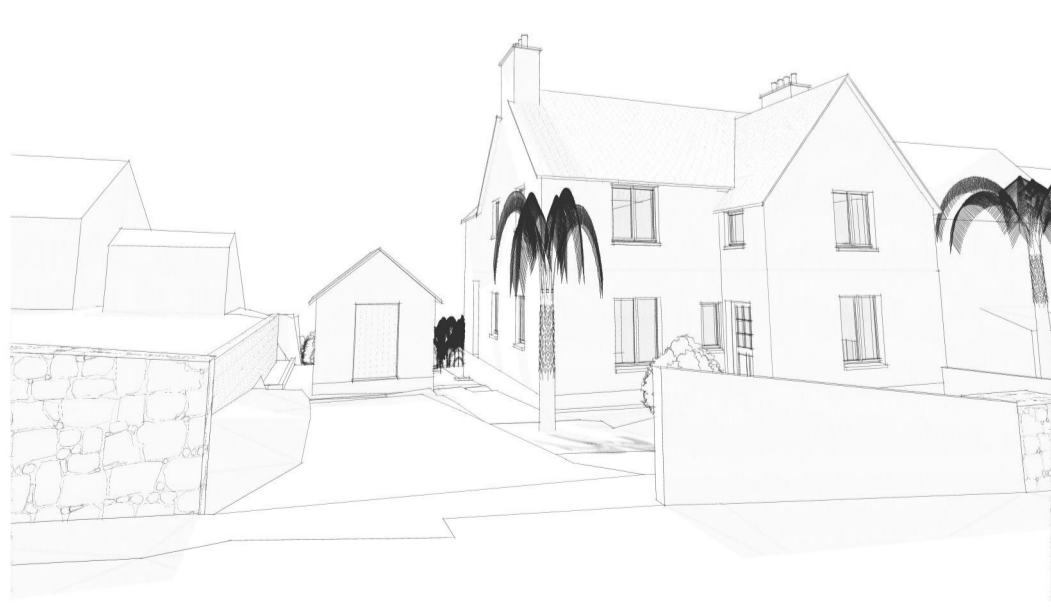
Front (South) As Existing