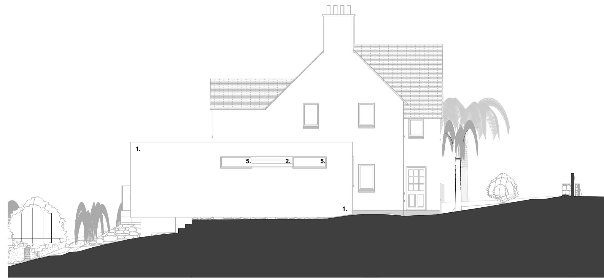
E-02 Proposed West Elevation 1:100