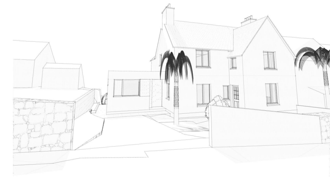
Front (South) As Proposed