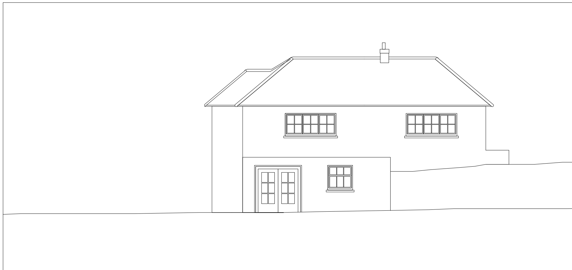
2 Existing elevation: South Scale: 1:100