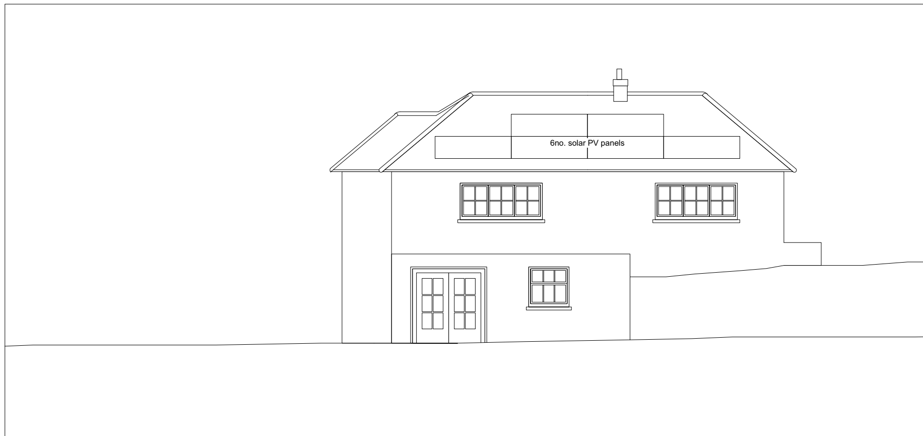
2 Proposed elevation: South Scale: 1:100