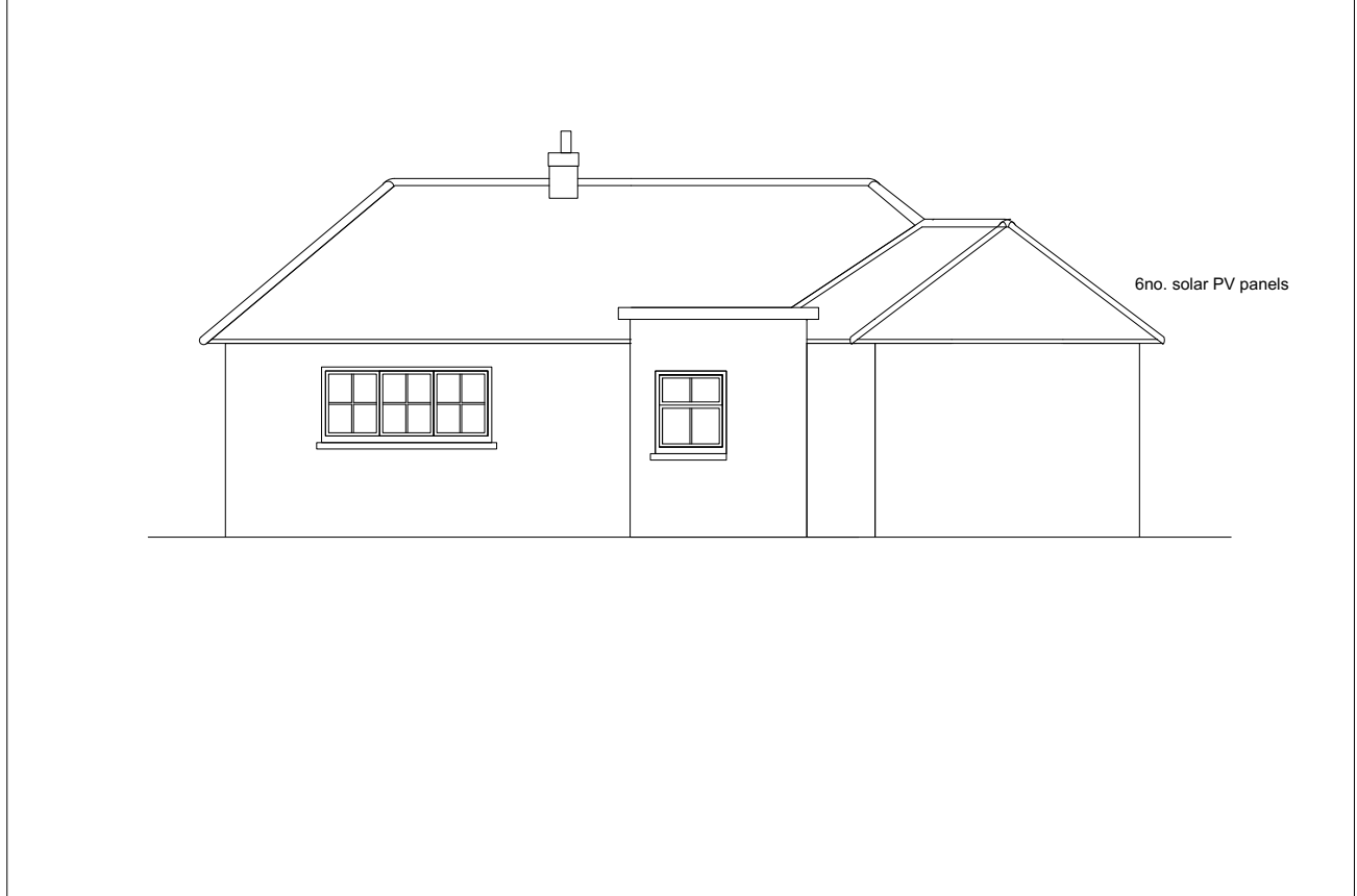
6 Proposed elevation: North Scale: 1:100