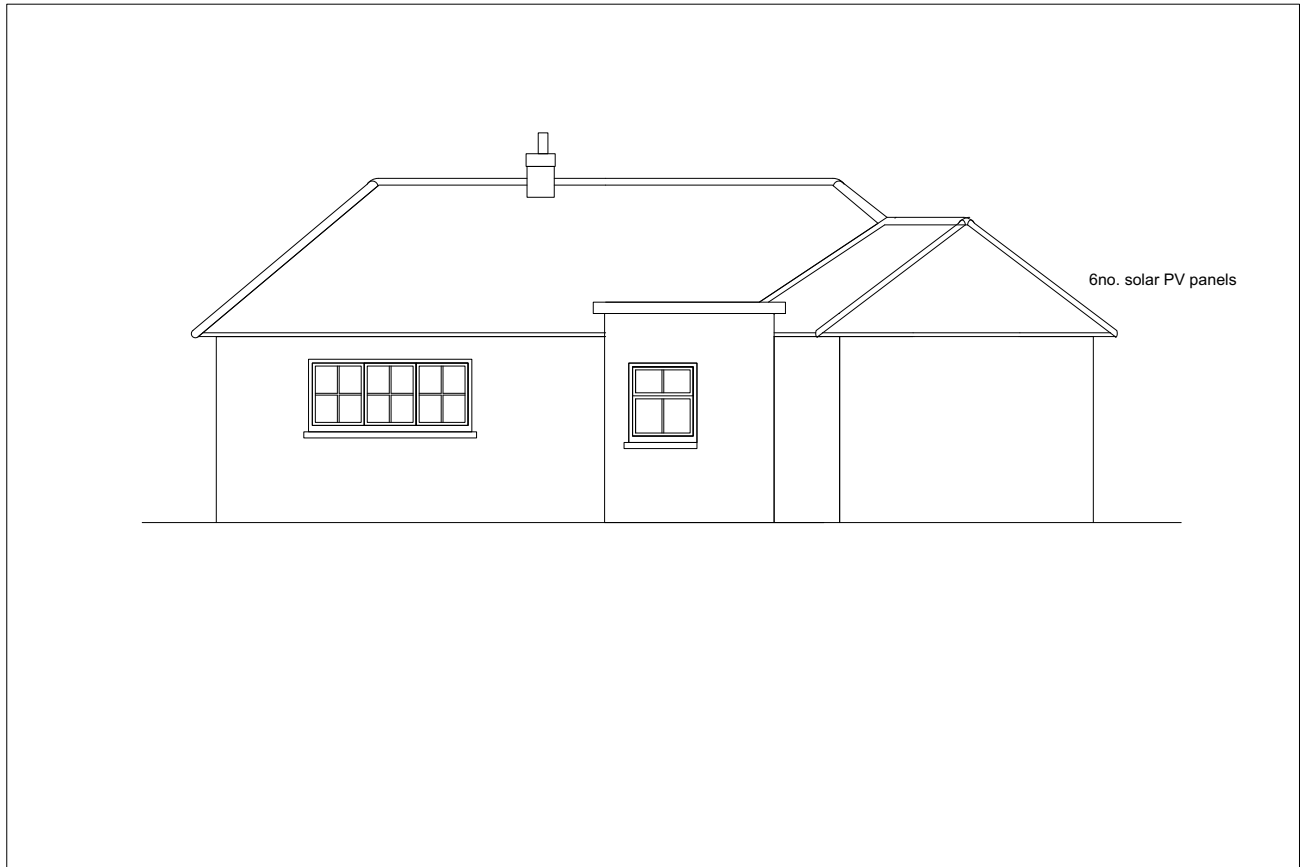
5 Existing elevation: North Scale: 1:100