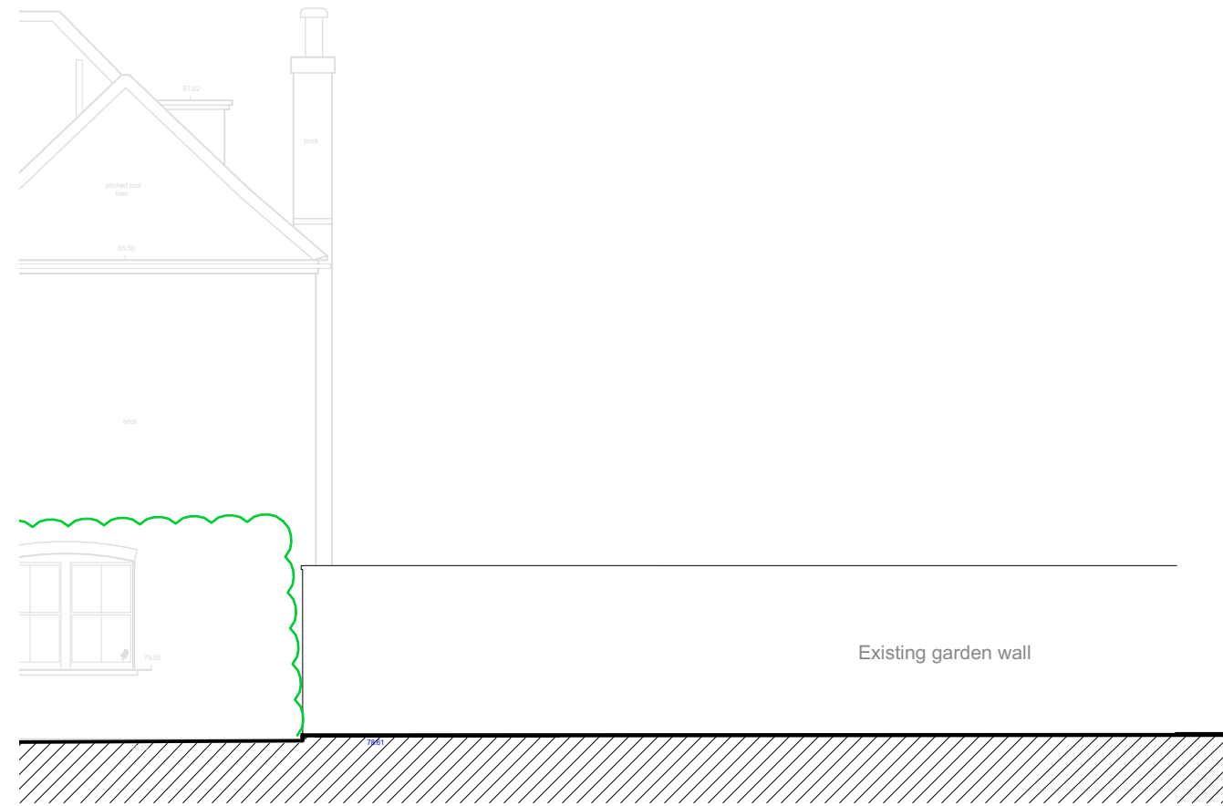
ELEVATION AA 1:100 @ A3