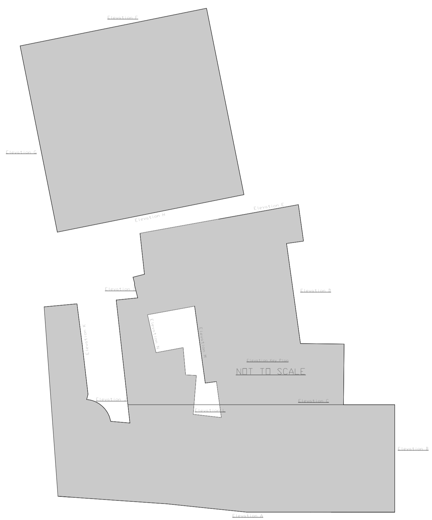
Elevation Key - 1:200 @A1

Extents of proposed demolition identified with red hatched area.