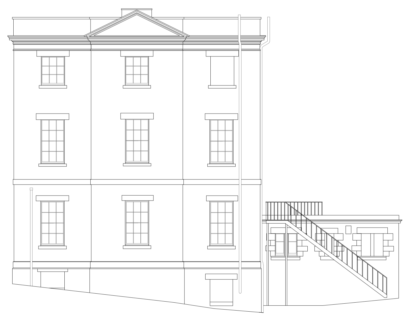
Elevation 1:100 @A1