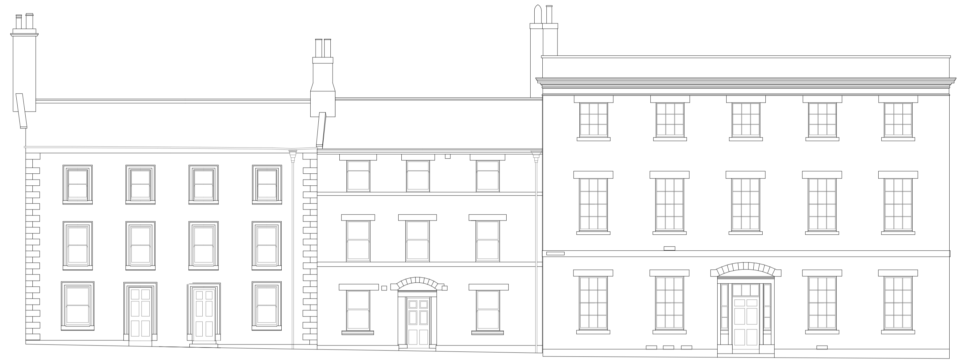
Elevation 1:100 @A1