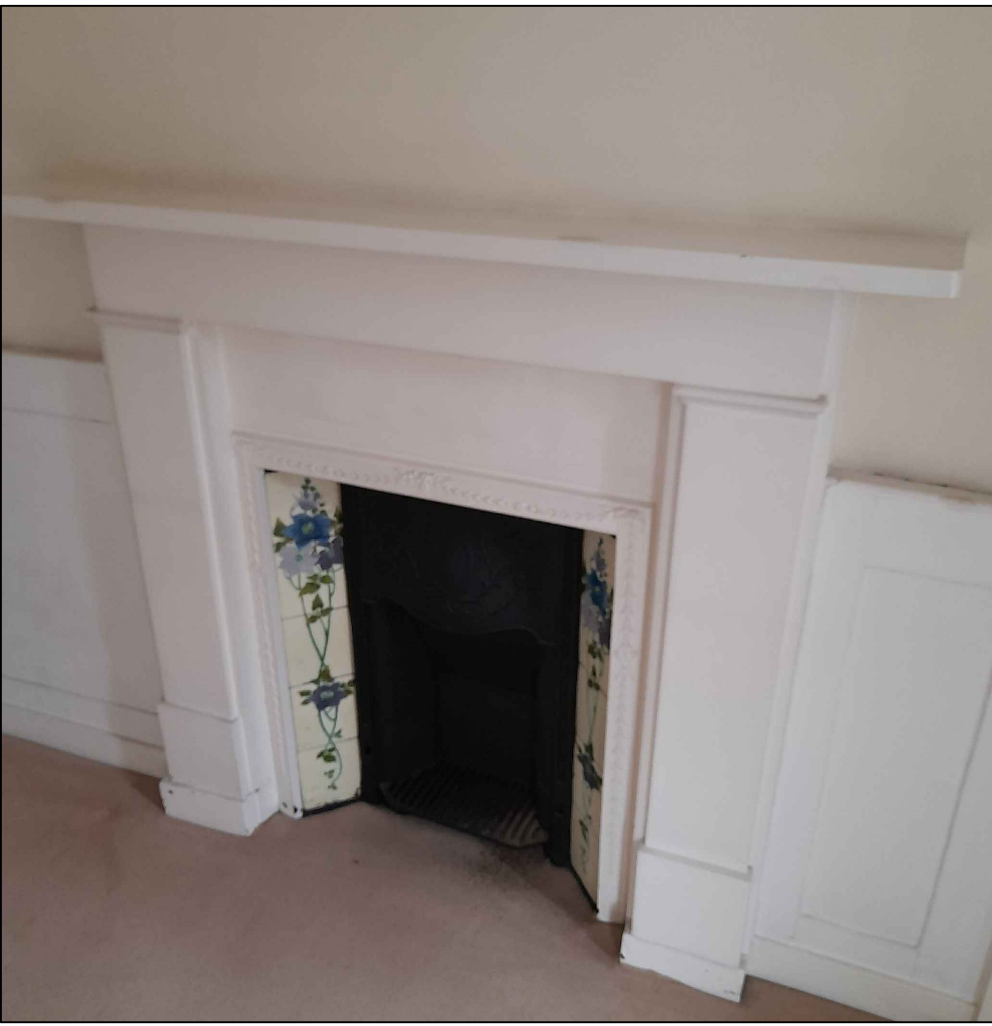
IMAGE OF PROPOSED CHIMNEY PIECE SURROUND (Retained and refurbished) - NTS