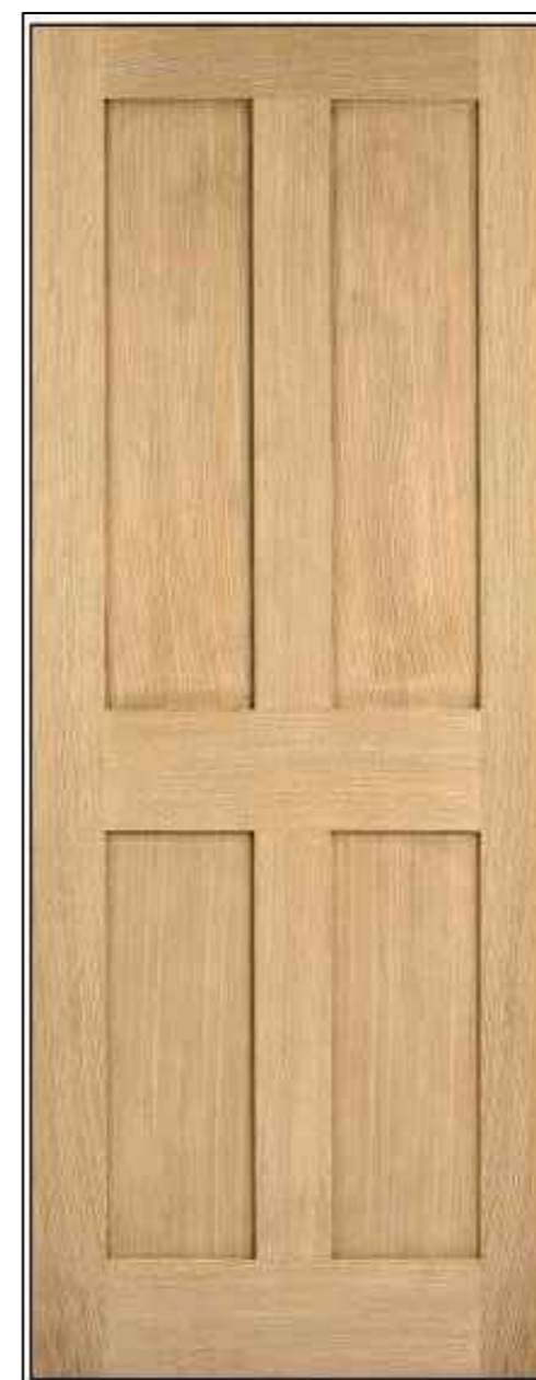
Square Edge Four Panel Door – NTS Finish in white

Note: New Square Edge Four Panel door to be installed to landing between First and Second Floor only. Door is to be FD30 at the request of the building control officer. All other internal doors are to be retained and made good.