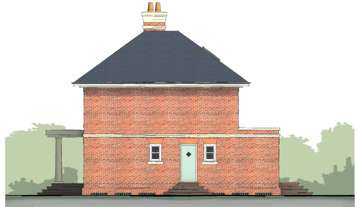
Side-North 1 : 100