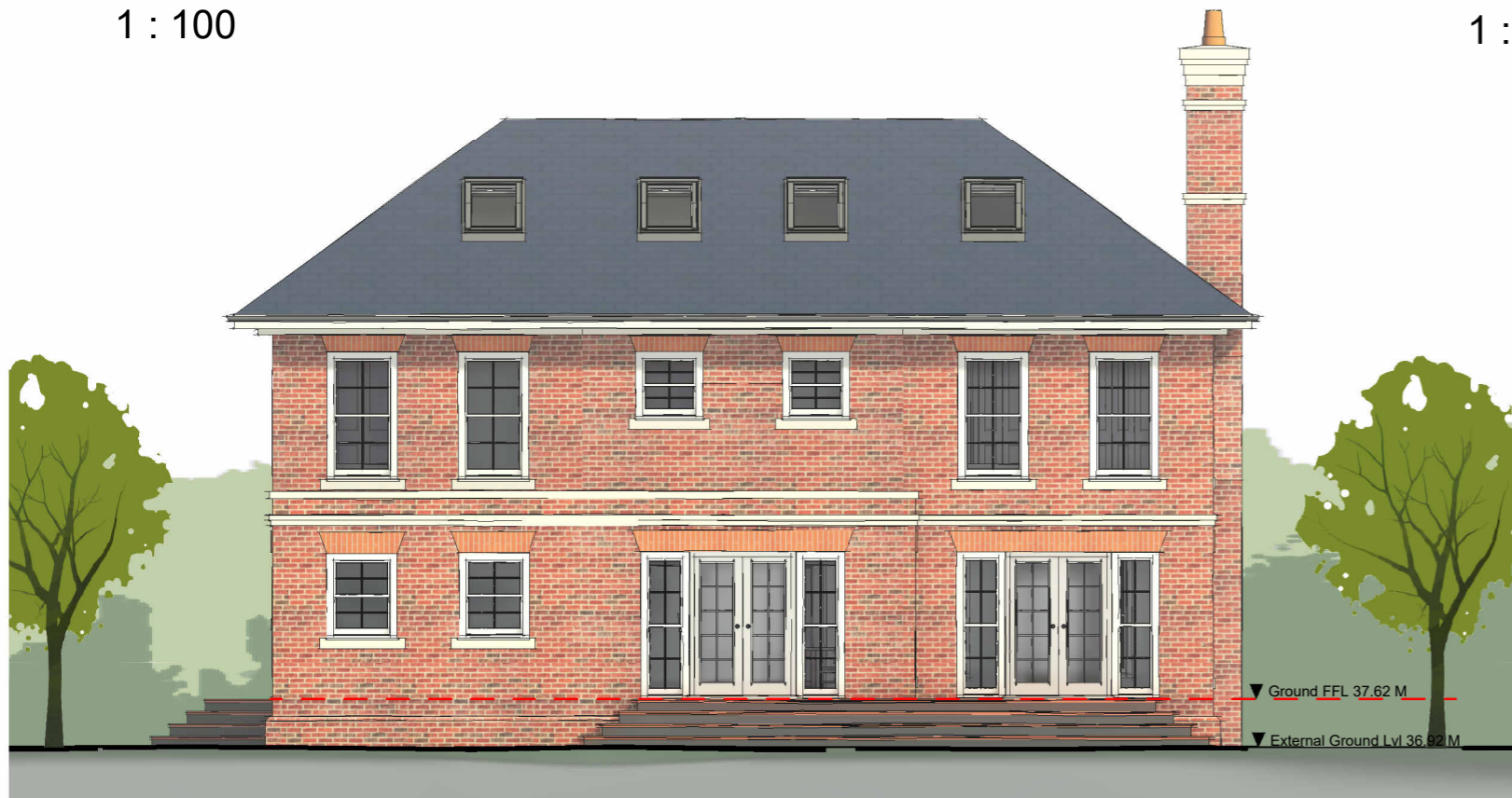
Rear-West 1 : 100